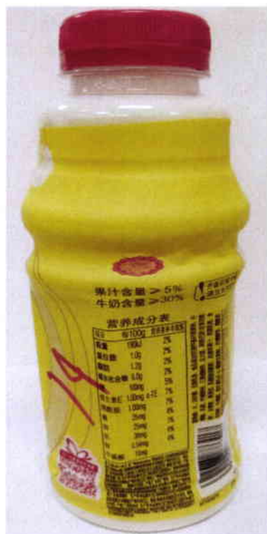
Figure 4. Unregistered HI NUTRI-EXPRESS (In Foreign Language)