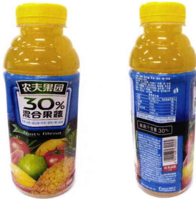
Figure 2. Unregistered Fruits Blend Juice Drink in PET Bottle (In Foreign Language)