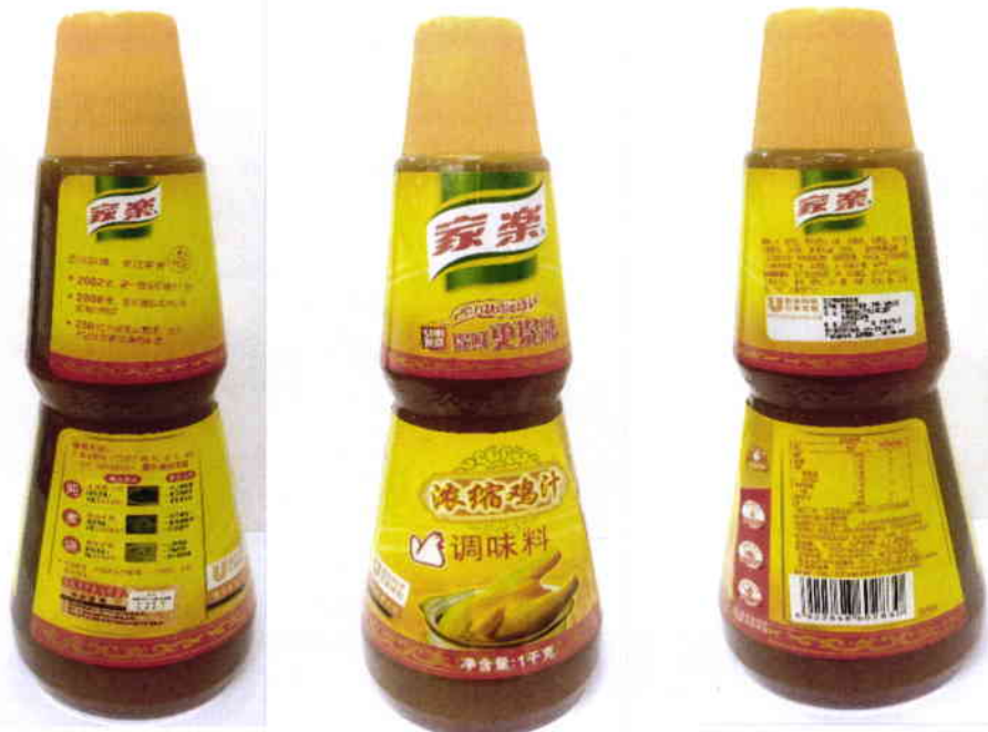
Figure 1. Unregistered Chicken Liquid Seasoning with Yellow and Green Design (In Foreign Language)

The Food and Drug Administration (FDA) warns all healthcare professionals and the general public NOT TO PURCHASE AND CONSUME the following unregistered food products: