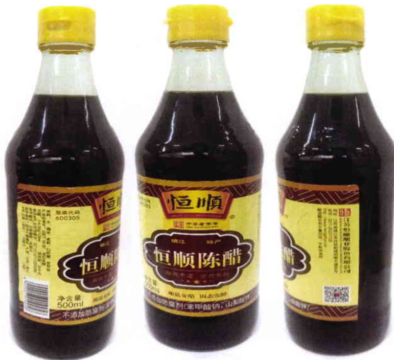
Figure 3. Unregistered CHINA TIME HONORED BRAND Liquid Seasoning in Glass Bottle (In Foreign Language)