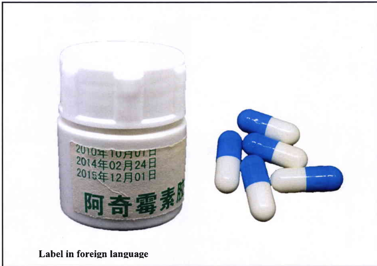
Label in foreign language