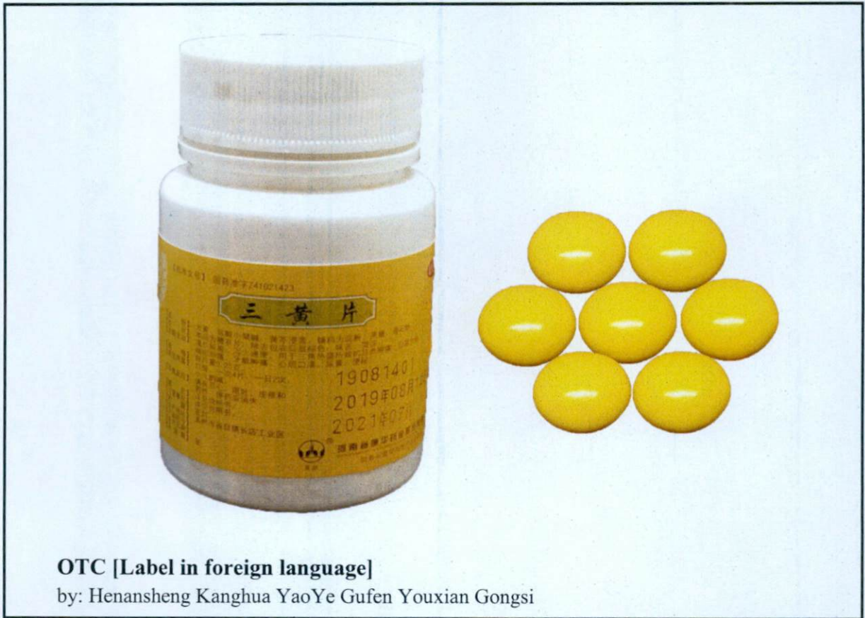
OTC [Label in foreign language]