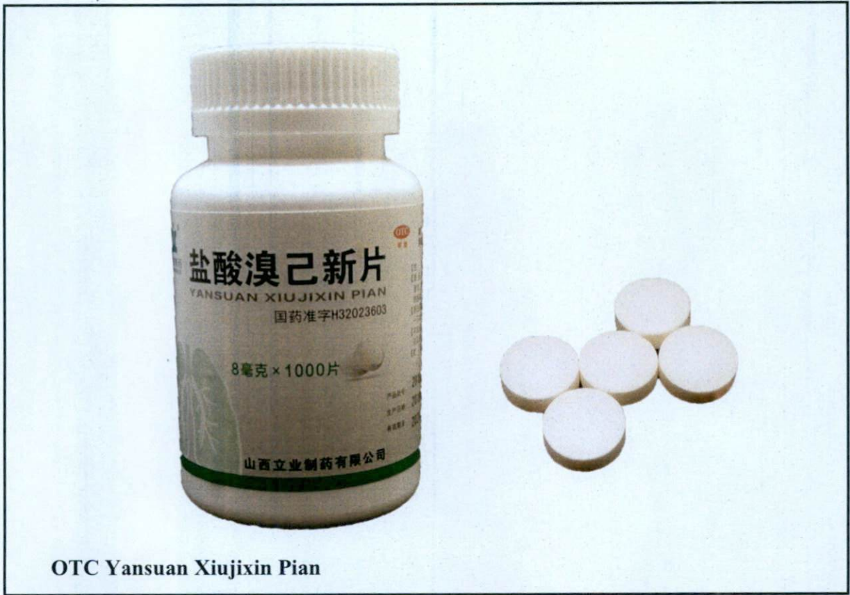
OTC Yansuan Xiujixin Pian