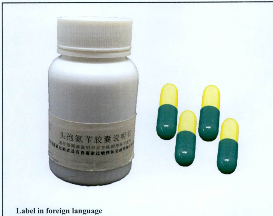
Label in foreign language

The Food and Drug Administration (FDA) advises the public against the purchase and use of the following unregistered drug products: