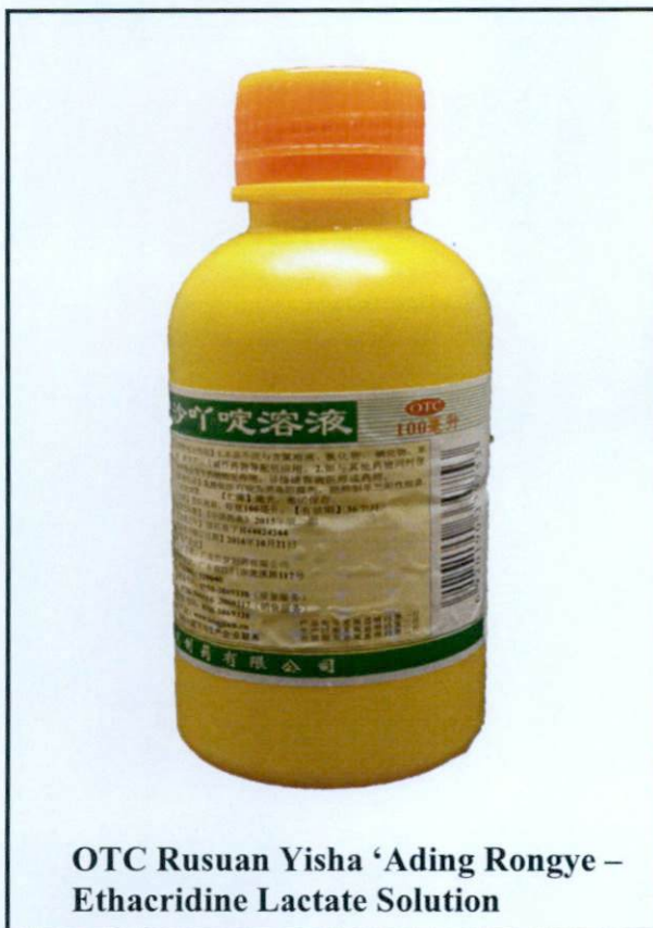
Figure 4. Unregistered drug product