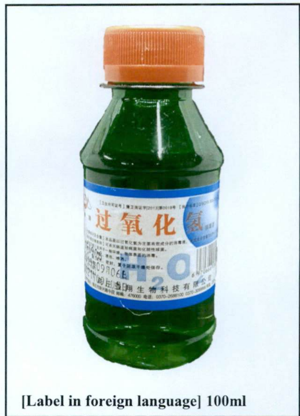
Figure 5. Unregistered drug product