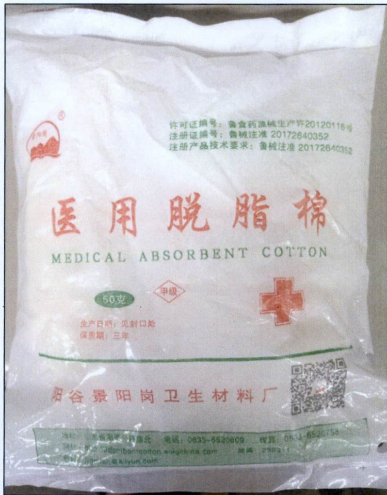
Figure 1. Unnotified Medical Absorbent Cotton (In foreign characters)

The Food and Drug Administration (FDA) warns all healthcare professionals and the general public NOT TO PURCHASE AND USE the unnotified medical device product: