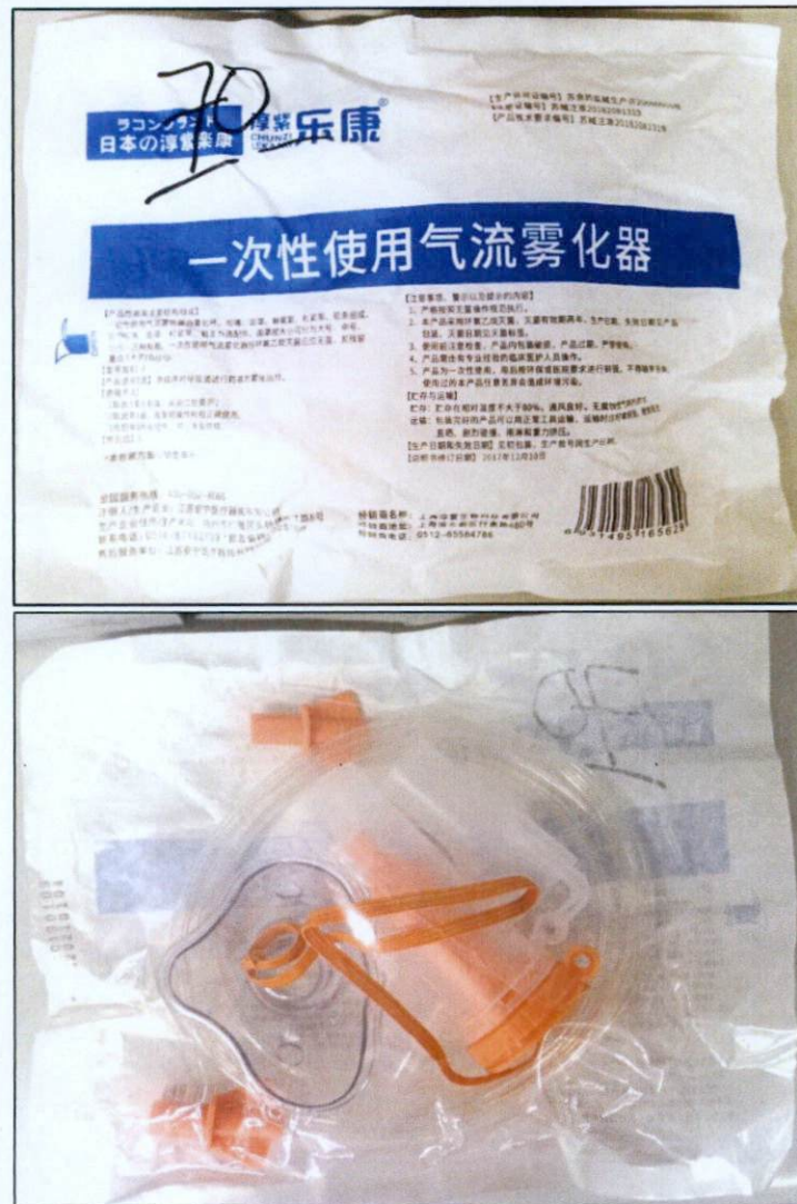
Figure 1. Unregistered Nebulizer Kit (In foreign characters)

The Food and Drug Administration (FDA) warns all healthcare professionals and the general public NOT TO PURCHASE AND USE the unregistered medical device product: