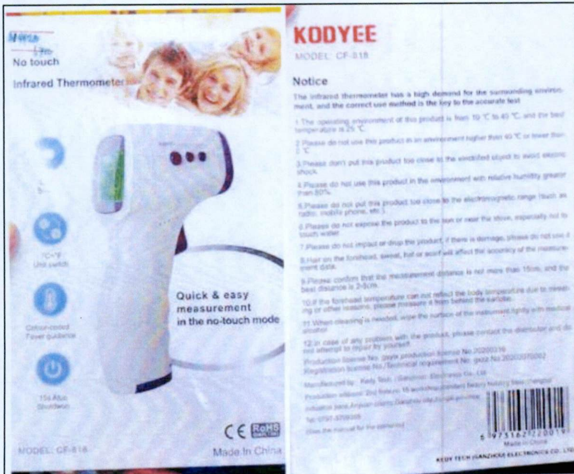
Figure 1. Unregistered Kodyee No Touch Infrared Thermometer (Model: CF-818)

The Food and Drug Administration (FDA) warns all healthcare professionals and the general public NOT TO PURCHASE AND USE the unregistered medical device product: