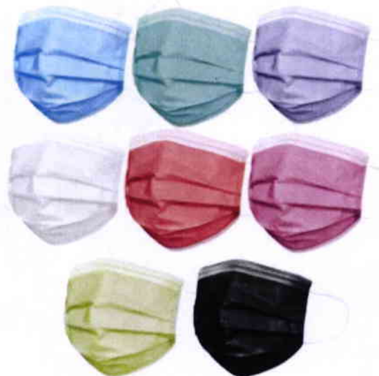
Figure 1. Unnotified ZOCN Disposable Face Mask for Adult