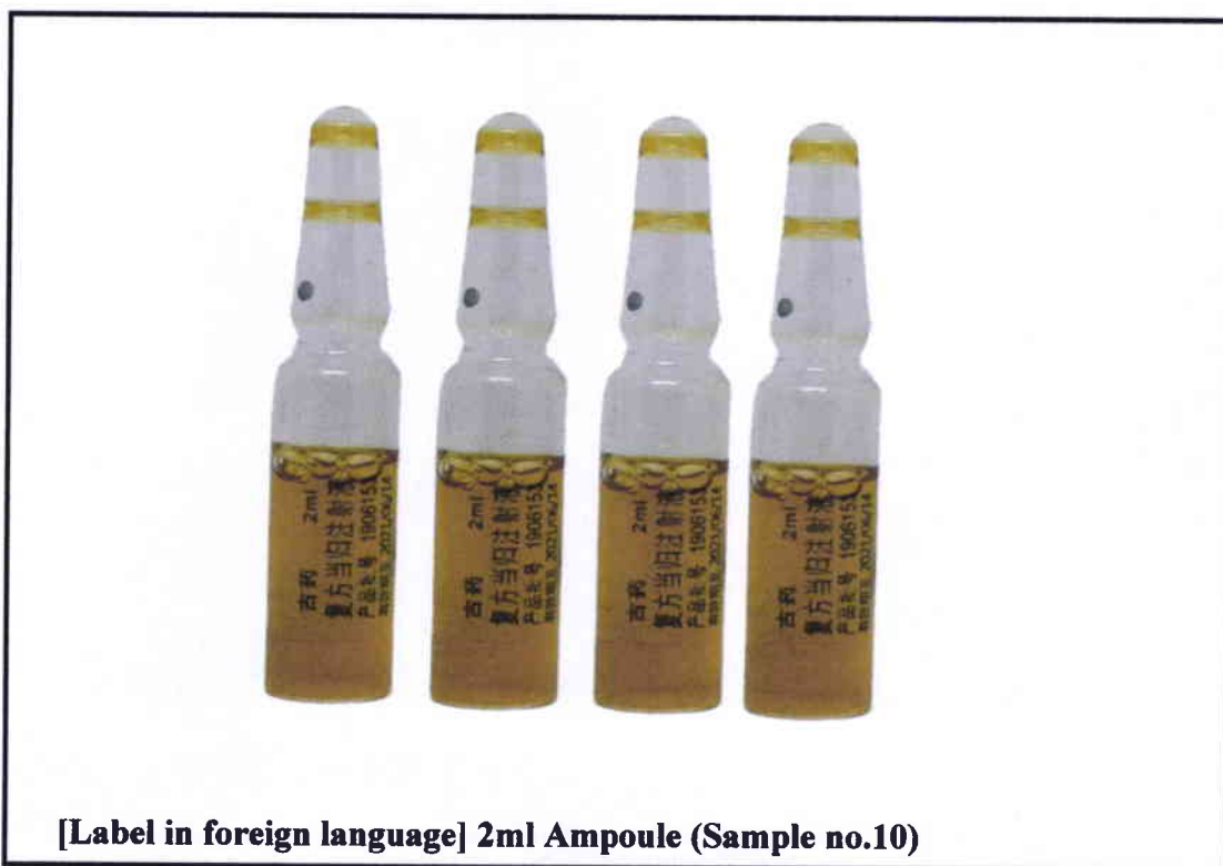
[Label in foreign language] 2ml Ampoule (Sample no.10)

The Food and Drug Administration (FDA) advises the public against the purchase and use of the following unregistered drug products: