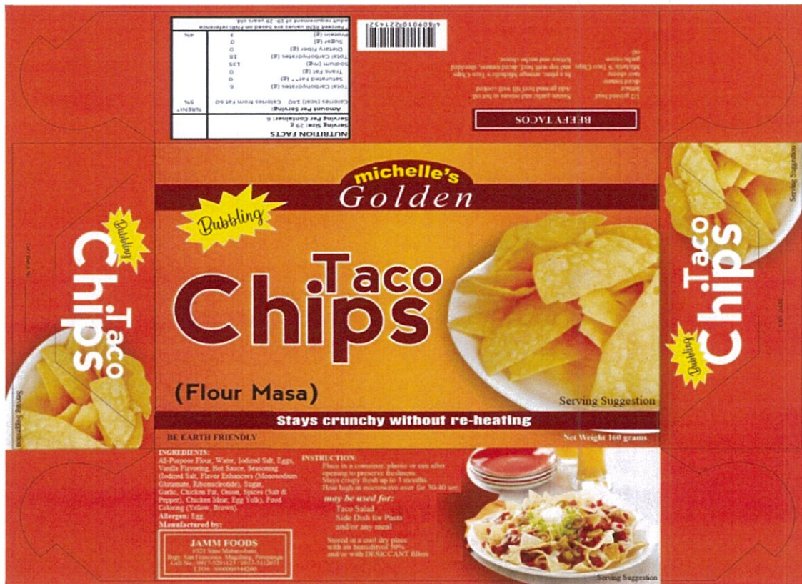
Figure 1. The Approved label of MICHELLE'S GOLDEN Taco Chips with registration number FR-400006318251 valid until 22 September 2025.

The Food and Drug Administration (FDA) informs the public that the food product MICHELLE'S GOLDEN TACO CHIPS is now registered by the Market Authorization Holder, JAMM FOODS , in accordance to existing FDA rules and regulations.