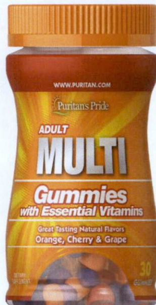
Figure 1. PURITAN'S PRIDE VITAMINS DIETARY SUPPLEMENT GUMMIES FOR OLDER ADULTS –ORANGE, CHERRY, & GRAPE (Registered as Food Supplement) WITH NO APPROVED THERAPEUTIC CLAIMS, FR-400006715993 issued on 24 August 2020 valid until 24 August 2022

The Food and Drug Administration (FDA) informs the public that the food supplement PURITAN'S PRIDE VITAMINS DIETARY SUPPLEMENT GUMMIES FOR OLDER ADULTS –ORANGE, CHERRY, & GRAPE (Registered as Food Supplement) WITH NO APPROVED THERAPEUTIC CLAIMS has been registered by the Market Authorization Holder (MAH) ALPHACOMMERCE CORPORATION , in accordance to existing FDA rules and regulations.