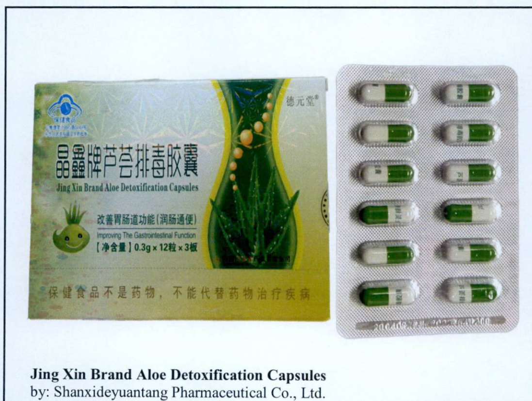
Figure 1. Unregistered drug

The Food and Drug Administration (FDA) advises the public against the purchase and use of the following unregistered drug products: