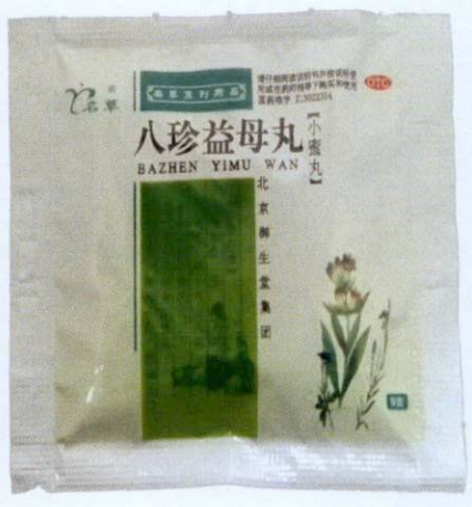
OTC Bazhen Yimu Wan