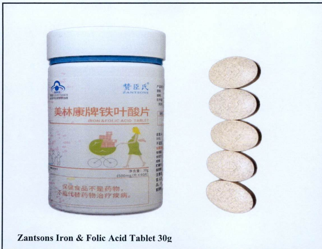
Zantsons Iron & Folic Acid Tablet 30g