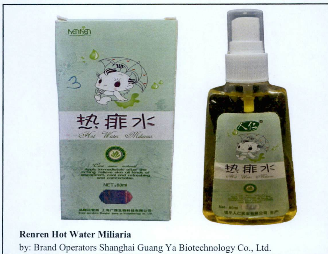
Figure 5. Unregistered drug product