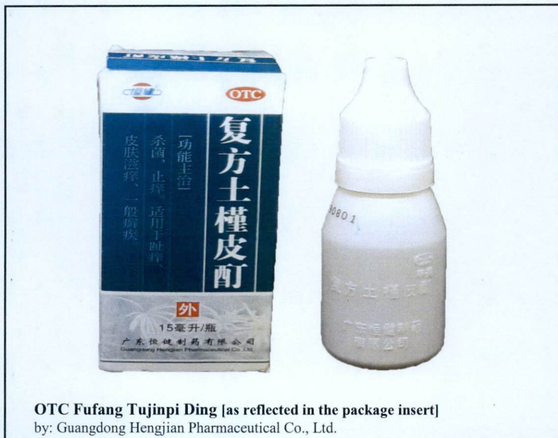
Figure 1. Unregistered drug product

The Food and Drug Administration (FDA) advises the public against the purchase and use of the following unregistered drug products: