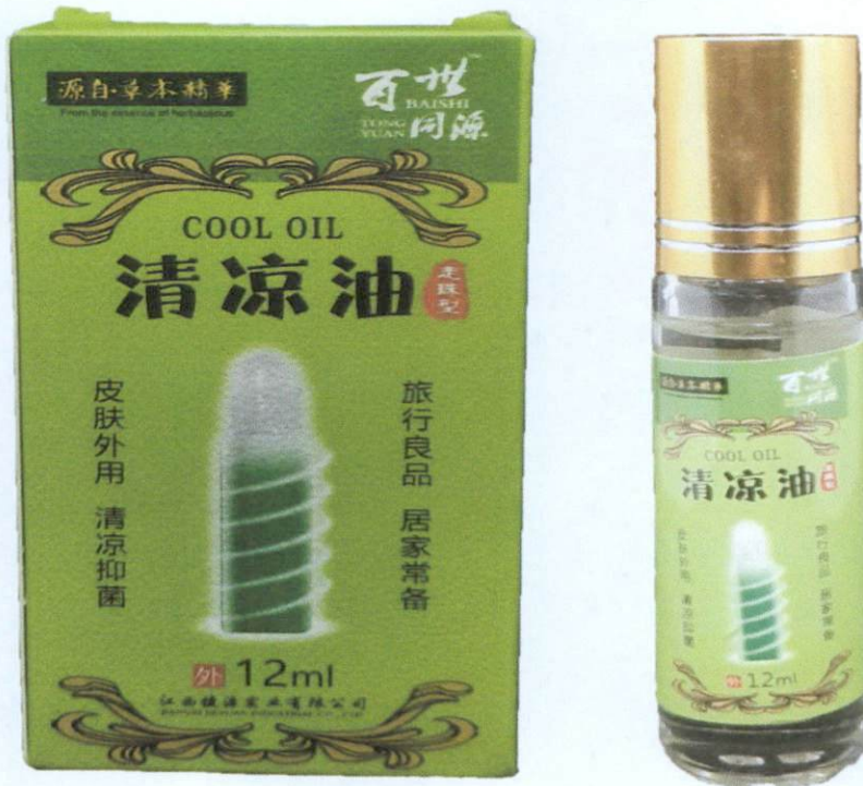
Baishi Tong Yuan Cool Oil 12mL by: Jiangxi Jieyuan Industrial Co., Ltd.