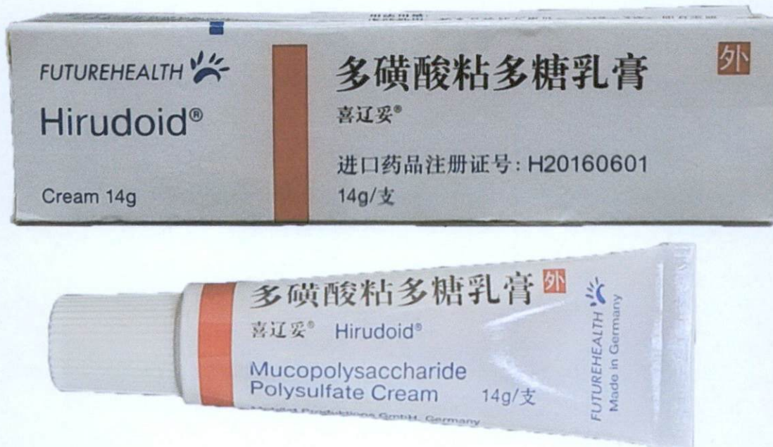
Futurehealth Hirudoid® Mucopolysaccharide Polysulfate Cream 14g by: Mobilat Produktions GmbH - Luitpoldstraße 1 85276 Pfaffenhofen/Ilm Germany