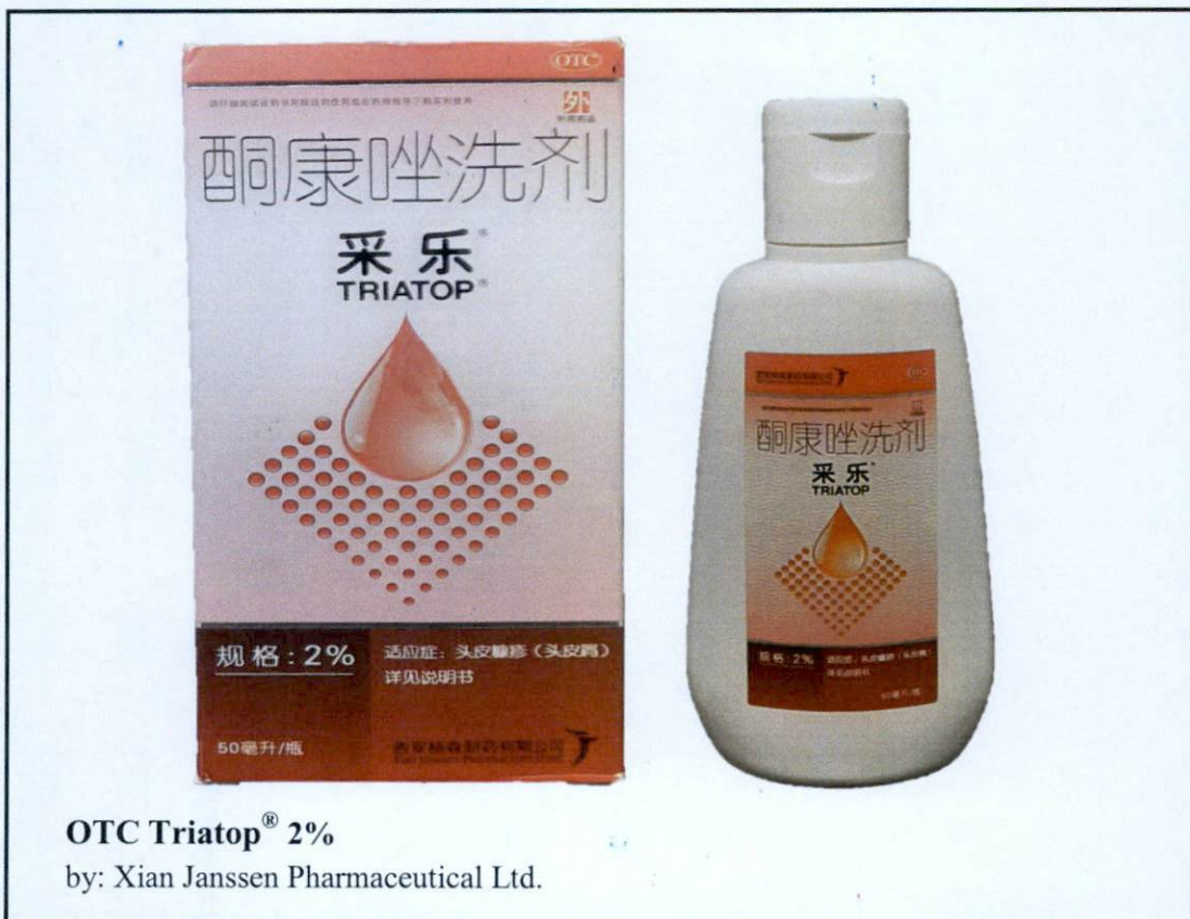
Figure 5. Unregistered drug product