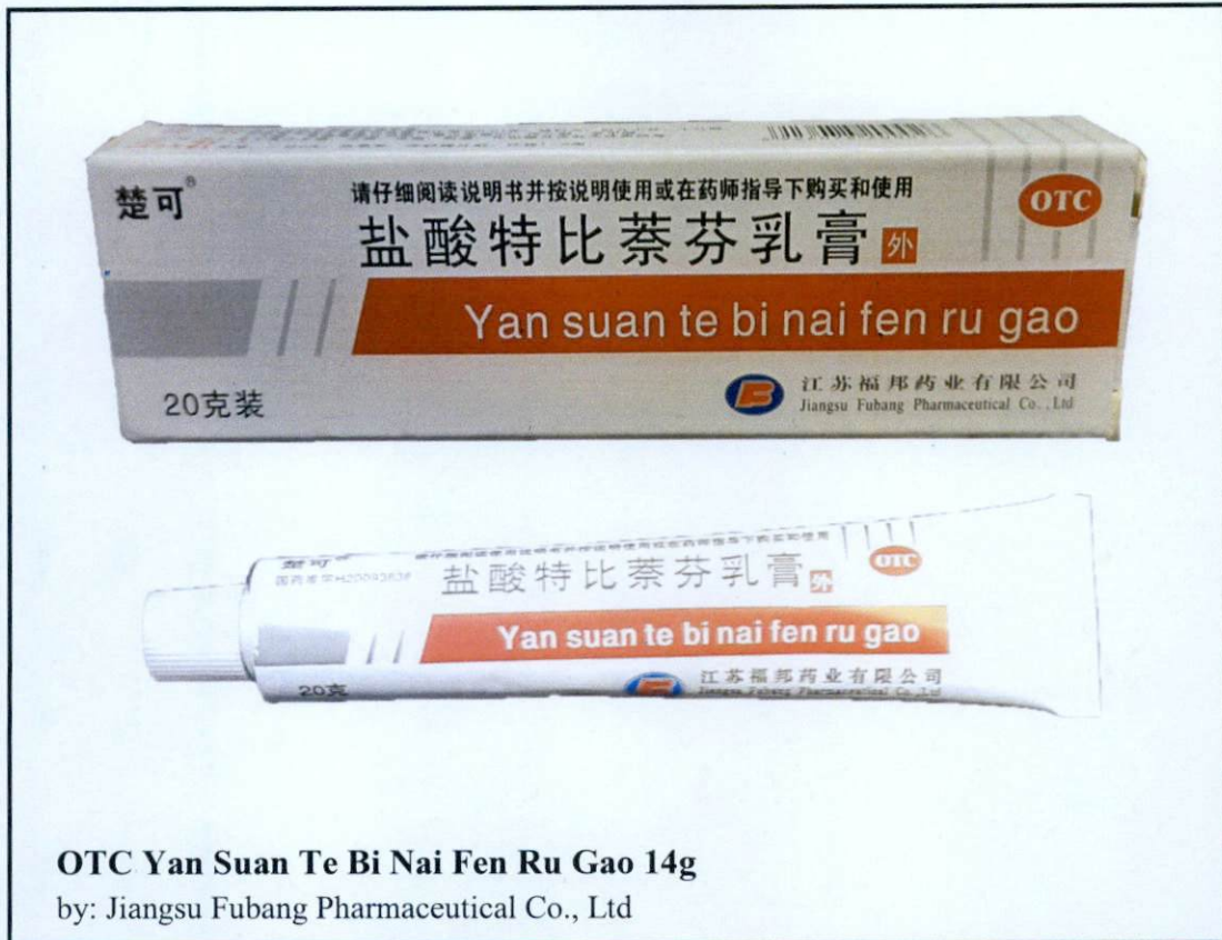
Figure 4. Unregistered drug product