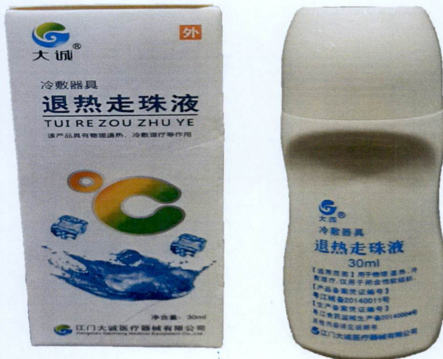
Tui Re Zou Zhu Ye 30mL by: Jiangmen Dacheng Medical Equipment Co., Ltd.