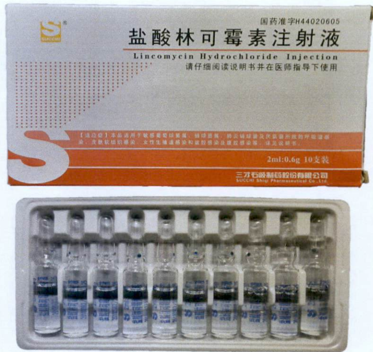
Succhi ® Lincomycin Hydrochloride Injection 2ml:0.6g by: Succhi Shiqi Parmaceutical Co., Ltd.