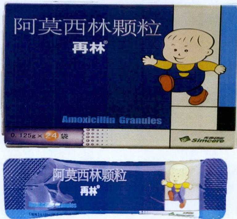
Sincere Amoxicillin Granules 0.125g