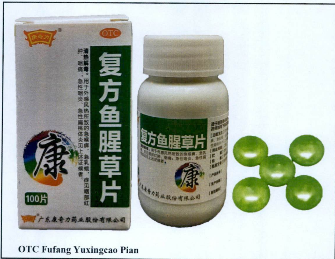
OTC Fufang Yuxingcao Pian