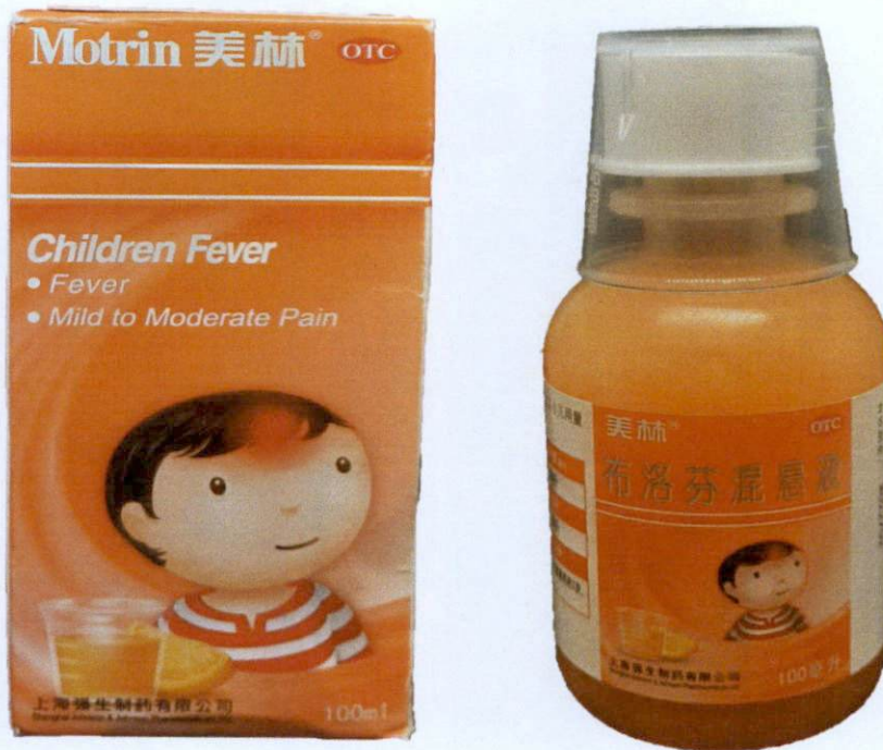
OTC Motrin® Ibuprofen Suspension 100mL- Buluofen Hunxuanye [as reflected in the package insert]