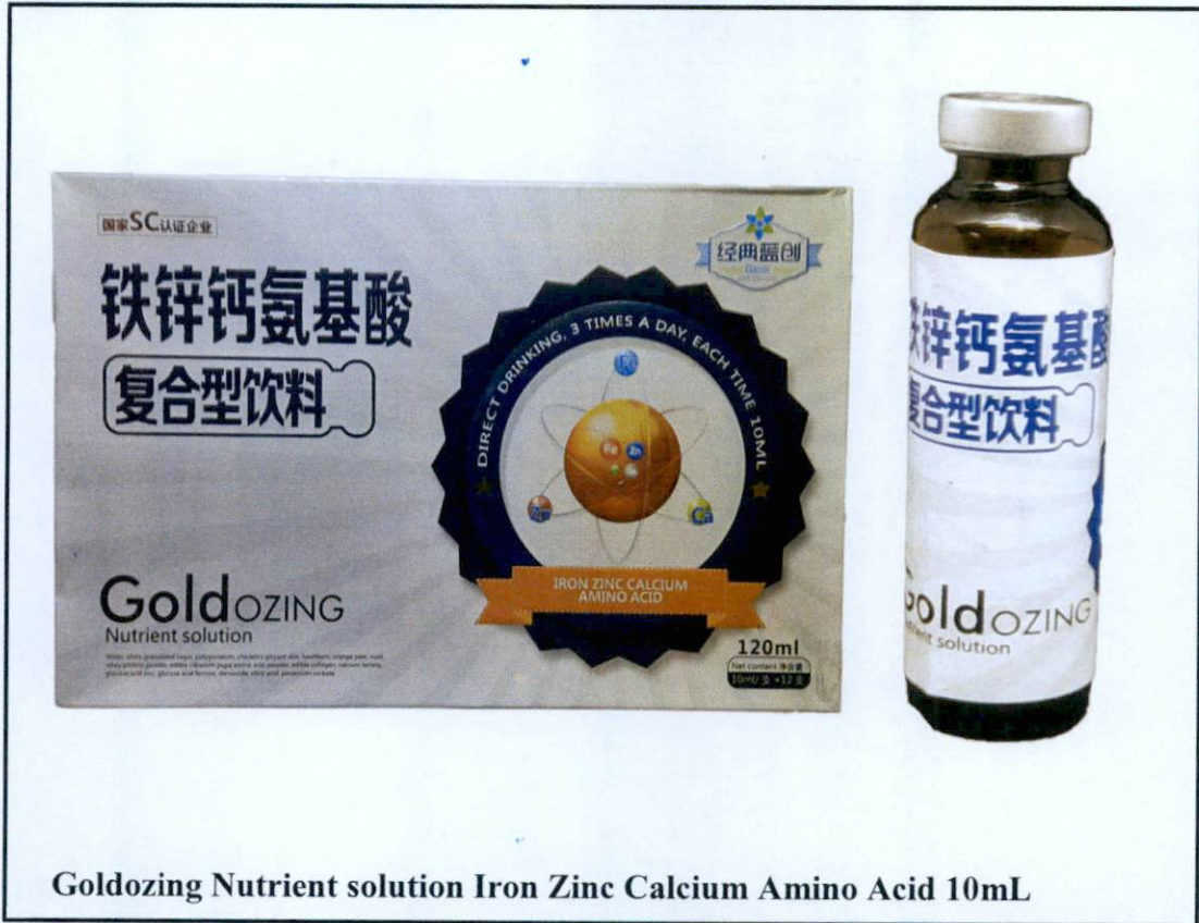
Goldozing Nutrient solution Iron Zinc Calcium Amino Acid 10mL