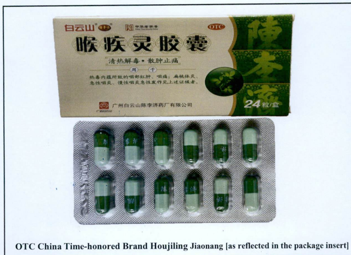
OTC China Time-honored Brand Houjiling Jiaonang [as reflected in the package insert]