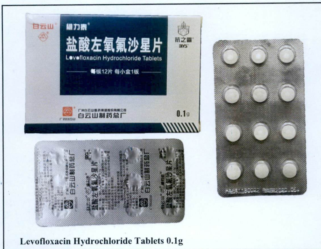
Figure 5. Unregistered drug product