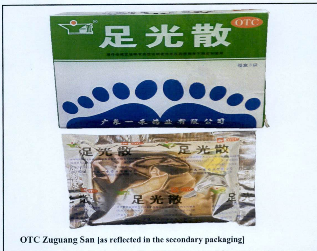
OTC Zuguang San [as reflected in the secondary packaging]

The Food and Drug Administration (FDA) advises the public against the purchase and use of the following unregistered drug products: