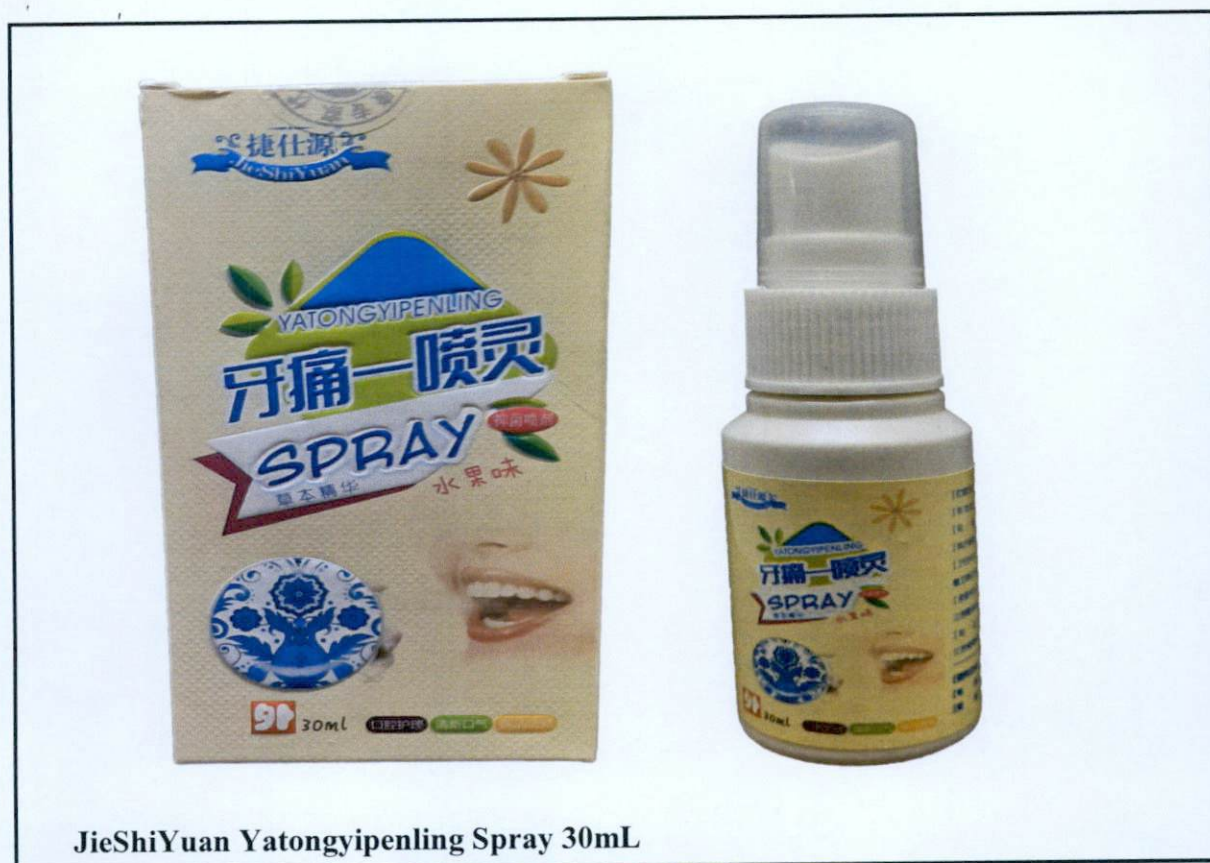
JieShiYuan Yatongyipenling Spray 30mL