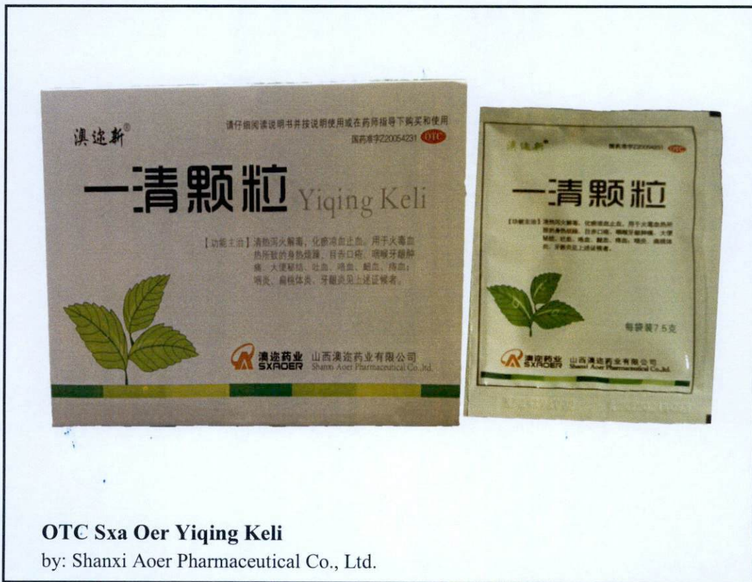
Figure 5. Unregistered drug product