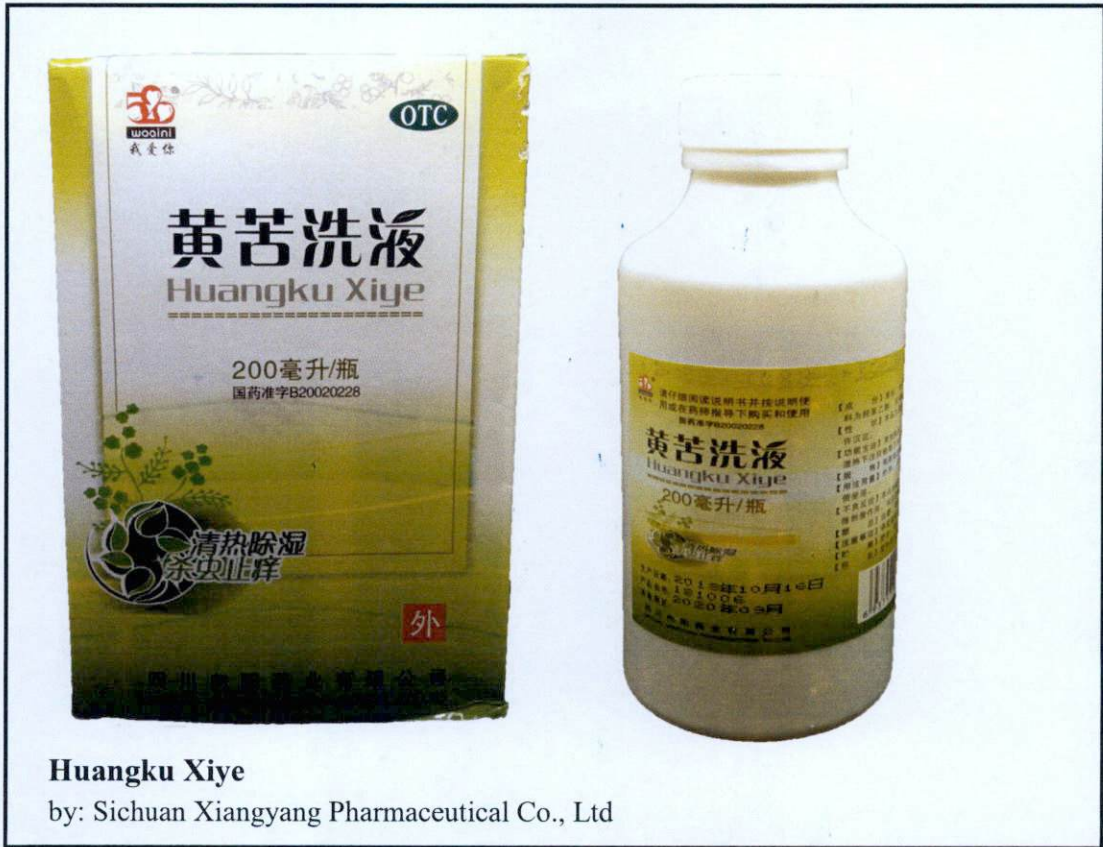
Figure 4. Unregistered drug product