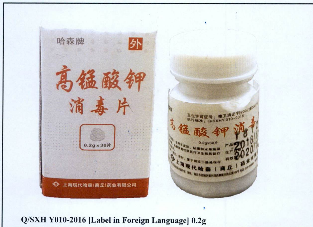
Q/SXH Y010-2016 [Label in Foreign Language] 0.2g