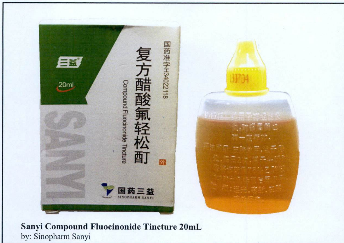
Sanyi Compound Fluocinonide Tincture 20mL by: Sinopharm Sanyi