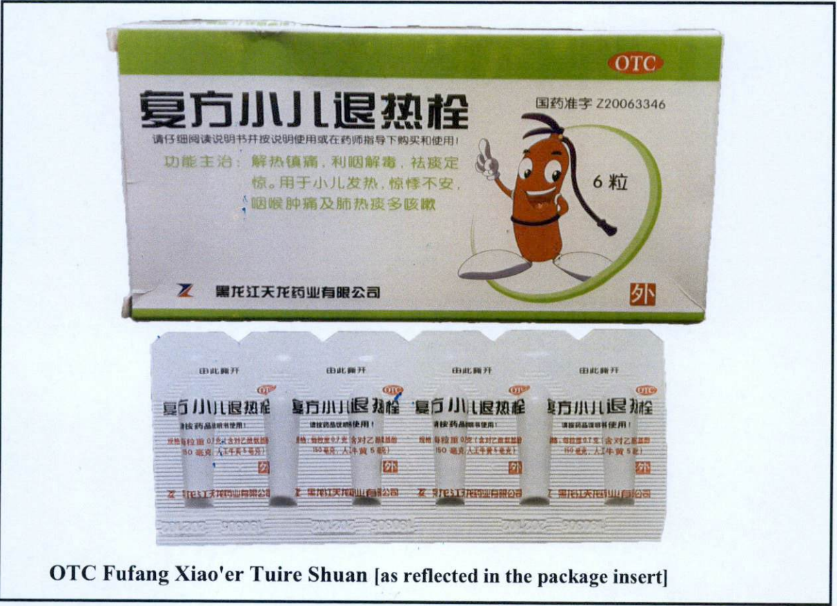
OTC Fufang Xiao'er Tuire Shuan [as reflected in the package insert]