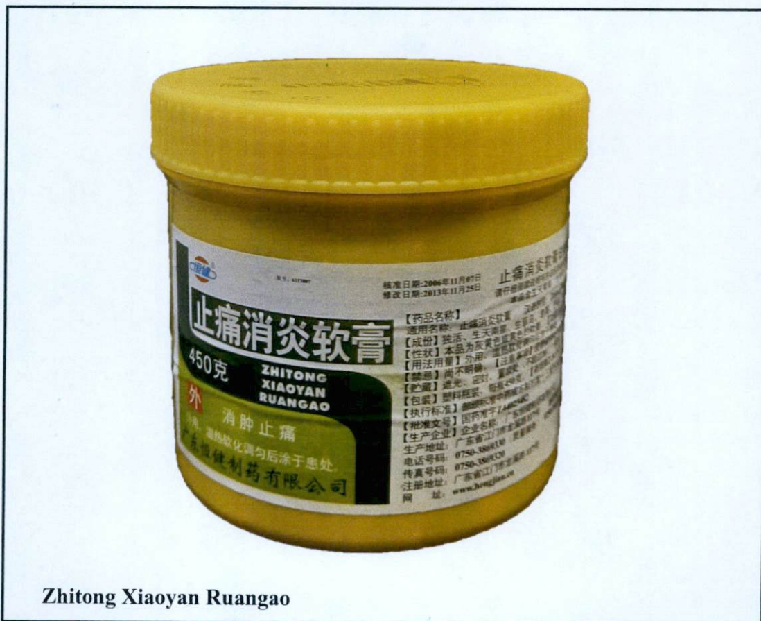
Zhitong Xiaoyan Ruangao

The Food and Drug Administration (FDA) advises the public against the purchase and use of the following unregistered drug products: