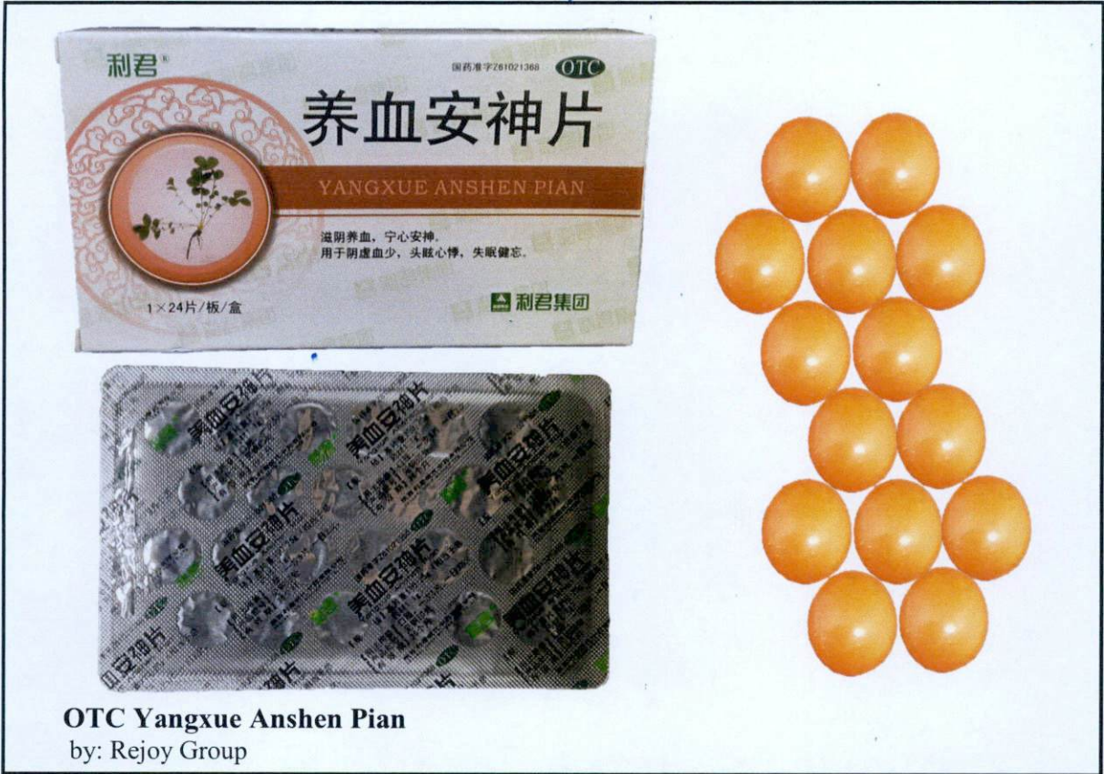
OTC Yangxue Anshen Pian by: Rejoy Group