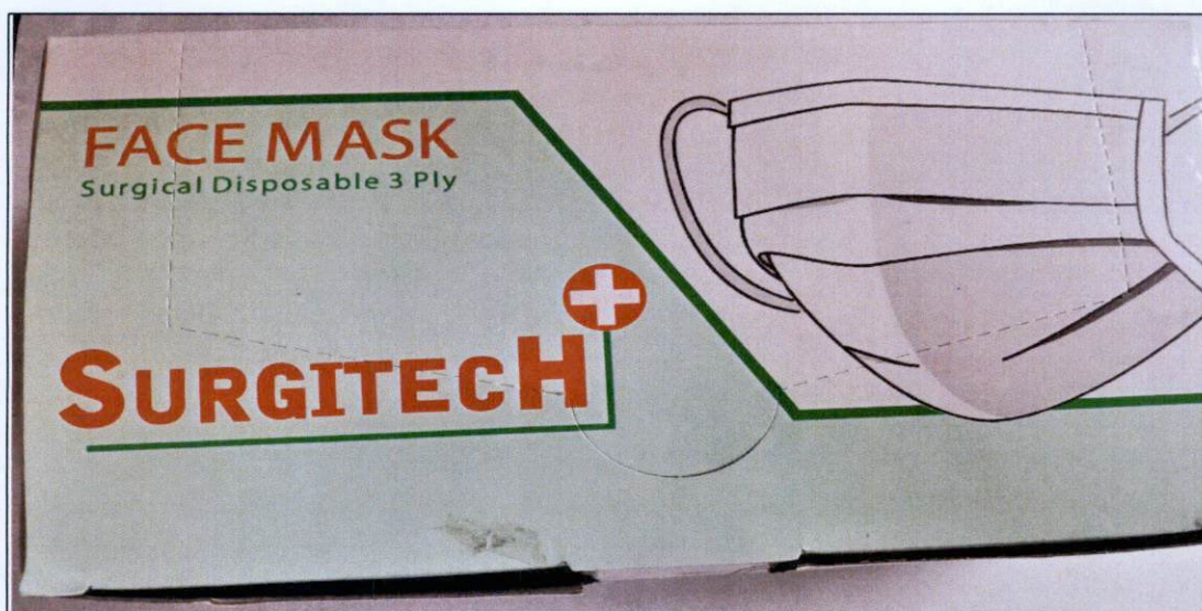
Figure 1. Unnotified Surgitech Face Mask (Surgical Disposable 3Ply 50Pcs)

The Food and Drug Administration (FDA) warns all healthcare professionals and the general public NOT TO PURCHASE AND USE the unnotified medical device product: