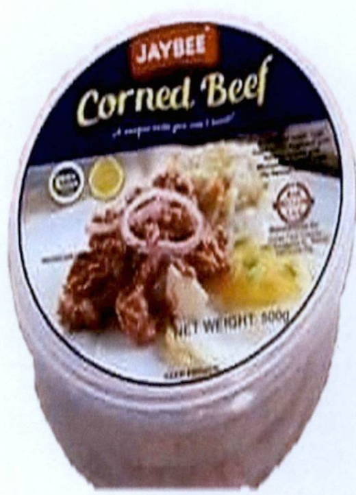
Figure 5. Unregistered JAYBEE Corned Beef