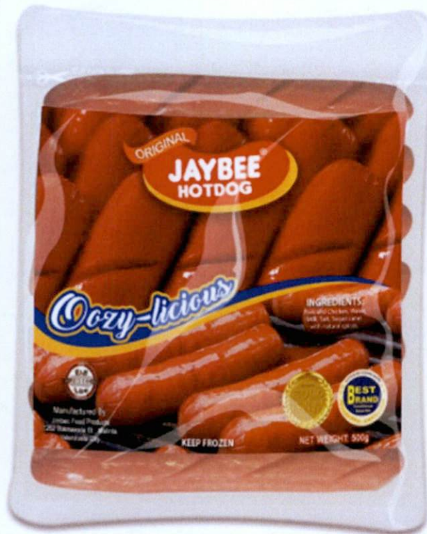
Figure 1. Unregistered JAYBEE Hotdog Original

The Food and Drug Administration (FDA) warns all healthcare professionals and the general public NOT TO PURCHASE AND CONSUME the following unregistered food products: