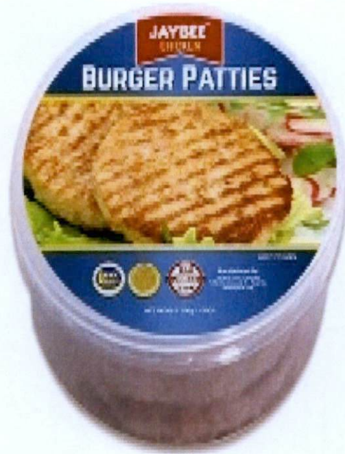
Figure 3. Unregistered JAYBEE Burger Patties Chicken