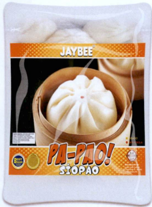
Figure 2. Unregistered JAYBEE Pa-Pao Siopao Bola-Bola