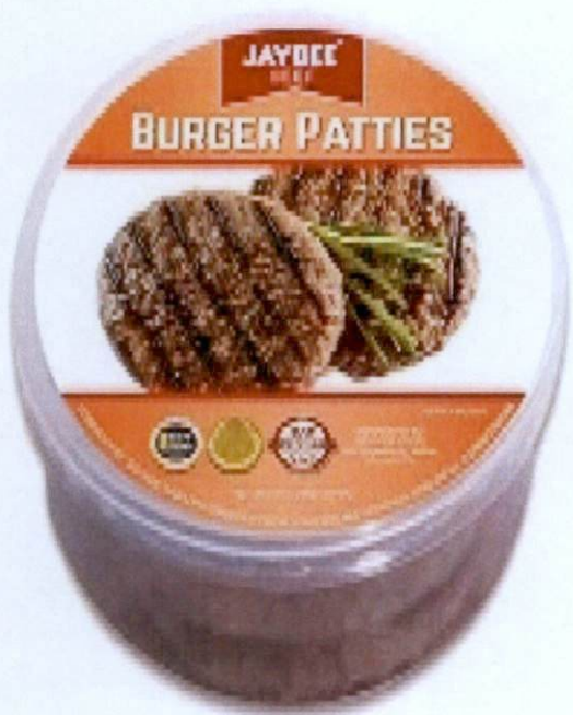
Figure 4. Unregistered JAYBEE Burger Patties Beef