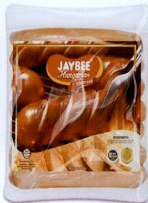
Figure 5. Unregistered JAYBEE Hungarian Sausage