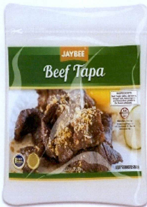
Figure 1. Unregistered JAYBEE Beef Tapa

The Food and Drug Administration (FDA) warns all healthcare professionals and the general public NOT TO PURCHASE AND CONSUME the following unregistered food products: