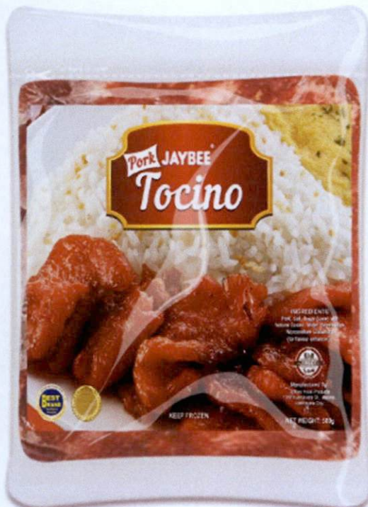
Figure 4. Unregistered JAYBEE Pork Tocino