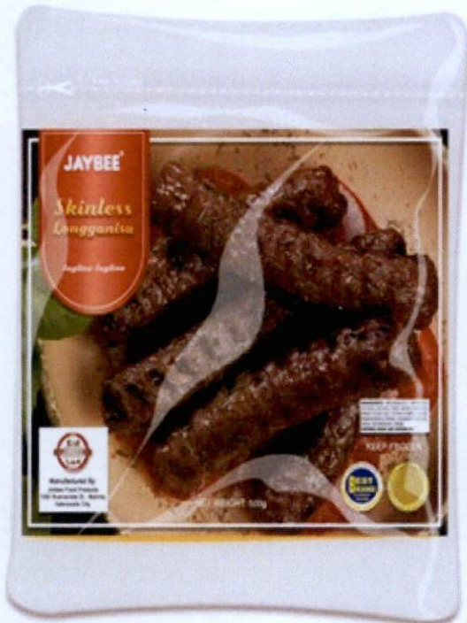
Figure 2. Unregistered JAYBEE Skinless Longganisa