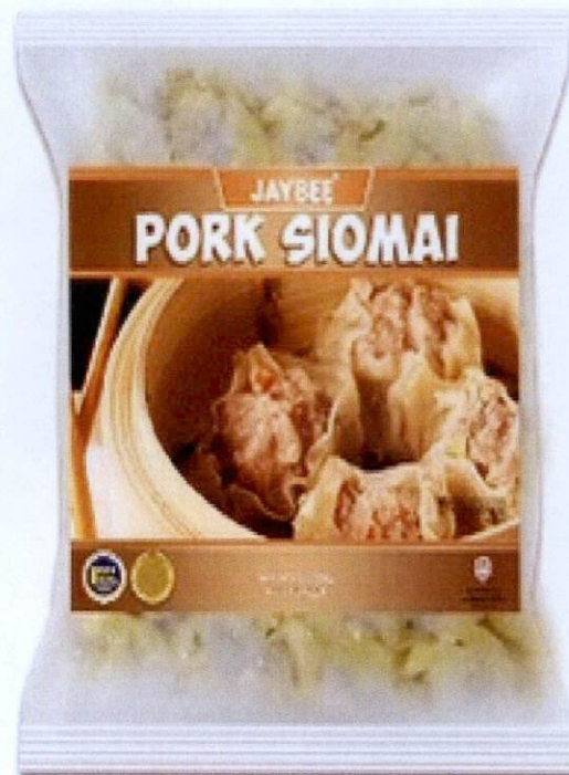
Figure 5. Unregistered JAYBEE Pork Siomai