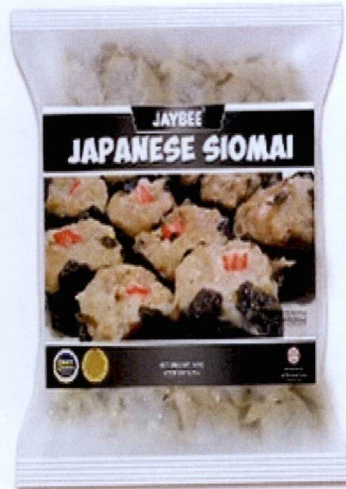
Figure 3. Unregistered JAYBEE Japanese Siomai