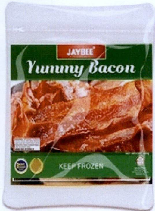
Figure 2. Unregistered JAYBEE Yummy Bacon