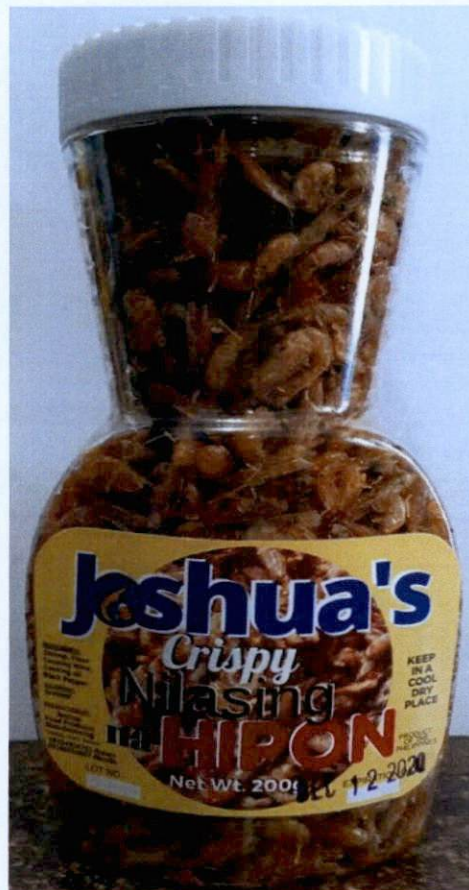
Figure 1. Unregistered JOSHUA'S Crispy Nilasing na Hipon, Net Wt. 200g

The Food and Drug Administration (FDA) warns all healthcare professionals and the general public NOT TO PURCHASE AND CONSUME the following unregistered food products: