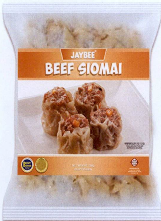
Figure 4. Unregistered JAYBEE Beef Siomai