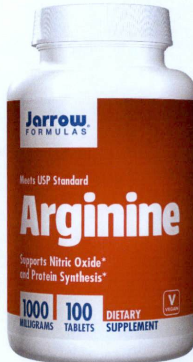
Figure 5. Unregistered JARROW FORMULAS® Arginine 1000mg Dietary Supplement, 100 Tablets