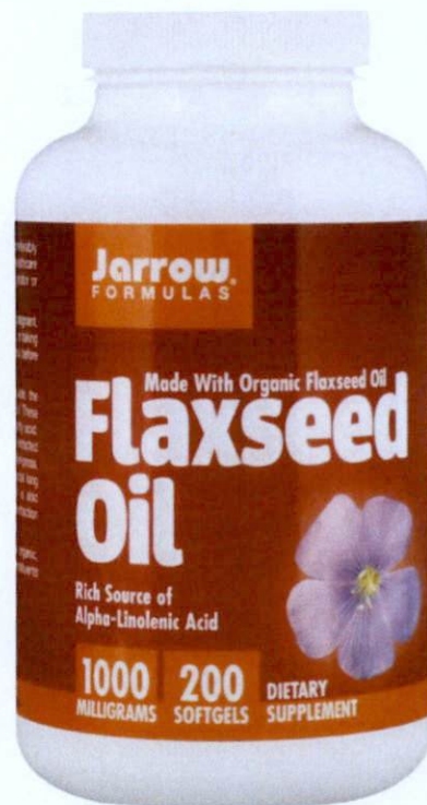
Figure 3. Unregistered JARROW FORMULAS® Flaxseed Oil 1000mg Dietary Supplement, 200 Softgels