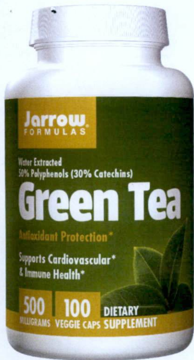
Figure 2. Unregistered JARROW FORMULAS® Green Tea 500mg Dietary Supplement, 100 Veggie Caps