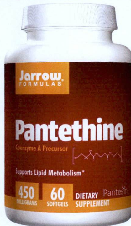
Figure 1. Unregistered JARROW FORMULAS ® Pantethine 450mg Dietary Supplement, 60 Softgels

The Food and Drug Administration (FDA) warns all healthcare professionals and the general public NOT TO PURCHASE AND CONSUME the following unregistered food supplements: