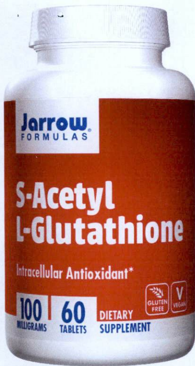
Figure 2. Unregistered JARROW FORMULAS® S-Acetyl L-Glutathione 100mg Dietary Supplement, 60 Tablets