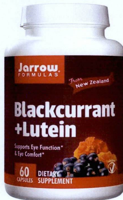
Figure 1. Unregistered JARROW FORMULAS ® Blackcurrant + Lutein Dietary Supplement, 60 Capsules

The Food and Drug Administration (FDA) warns all healthcare professionals and the general public NOT TO PURCHASE AND CONSUME the following unregistered food supplements: