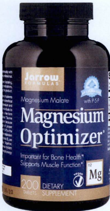
Figure 4. Unregistered JARROW FORMULAS® Magnesium Optimizer Dietary Supplement, 200 Tablets