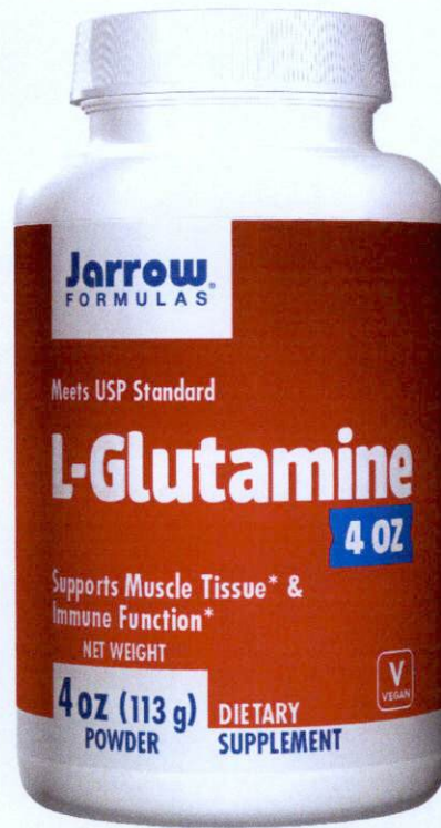
Figure 3. Unregistered JARROW FORMULAS® L-Glutamine Dietary Supplement, 113g (4oz) Powder