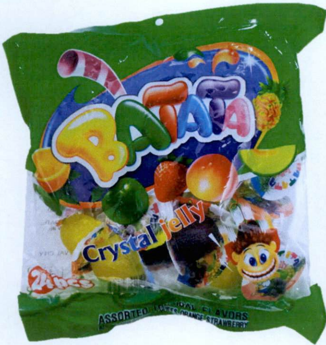
Figure 2. Unregistered BATATA Crystal Jelly Assorted Tropical Flavors