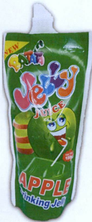
Figure 4. Unregistered BATATA Jelly Juice Apple Drinking Jelly