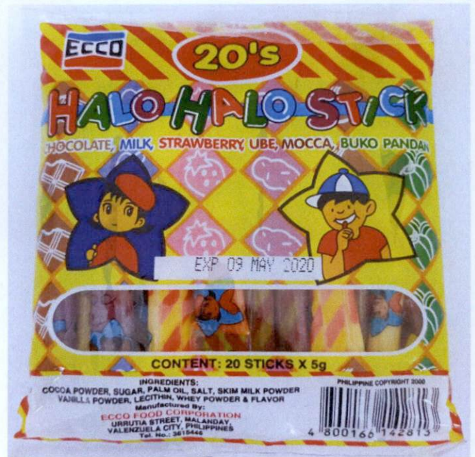
Figure 5. Unregistered ECCO Halo Halo Stick