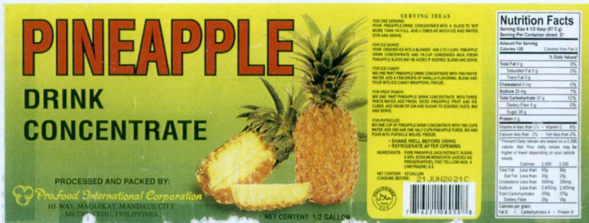
Figure 1. Unregistered Pineapple Drink Concentrate

The Food and Drug Administration (FDA) warns all healthcare professionals and the general public NOT TO PURCHASE AND CONSUME the following unregistered food products: