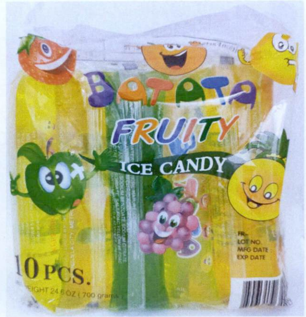
Figure 3. Unregistered BATATA Fruit Ice Candy Assorted Flavors