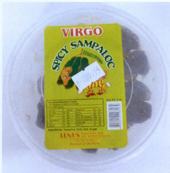
Figure 4. Unregistered VIRGO Spicy Sampaloc