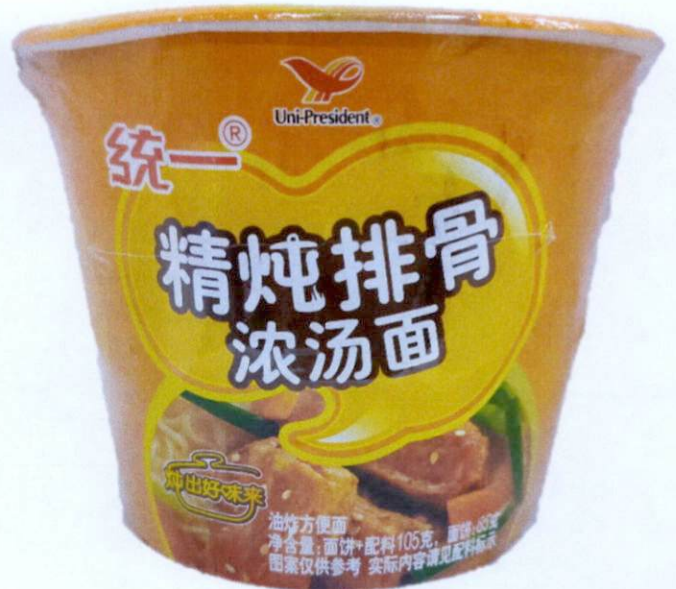
Figure 3. Unregistered UNI-PRESIDENT Cup Noodles in Orange Packaging