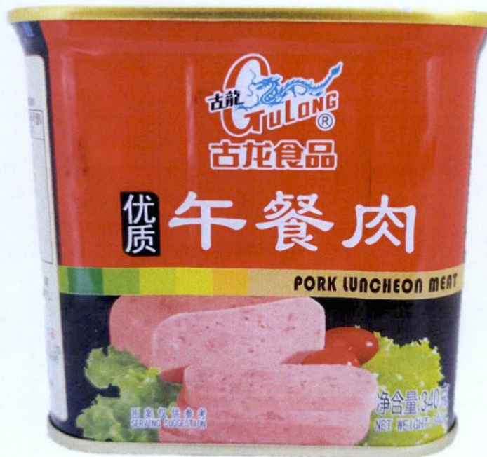
Figure 1. Unregistered GULONG Pork Luncheon Meat

The Food and Drug Administration (FDA) warns all healthcare professionals and the general public NOT TO PURCHASE AND CONSUME the following unregistered food products: