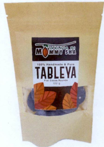
Figure 5. Unregistered TABLEYA NI MOMMY SHA 100% Handmade & Pure Tableya Flat Cocoa Rounds