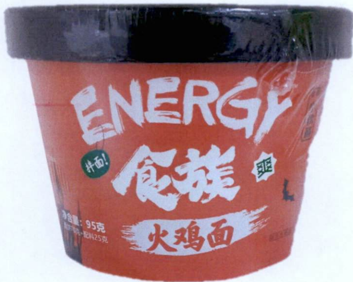
Figure 2. Unregistered ENERGY Cup Noodles in Red and Black Packaging