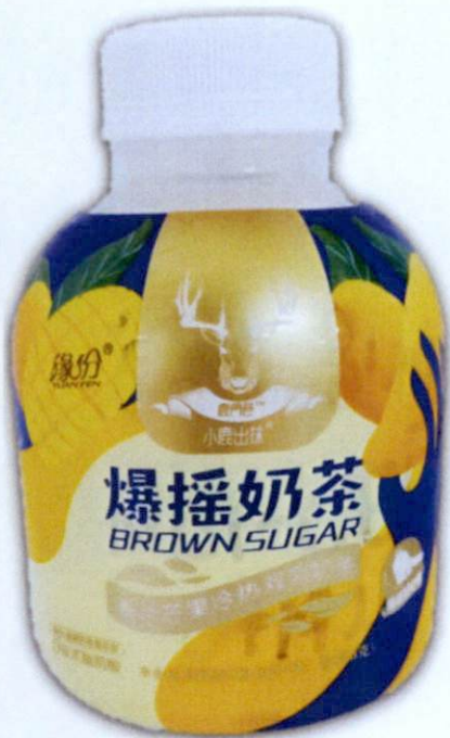
Figure 4. Unregistered YUAN FEN Brown Sugar