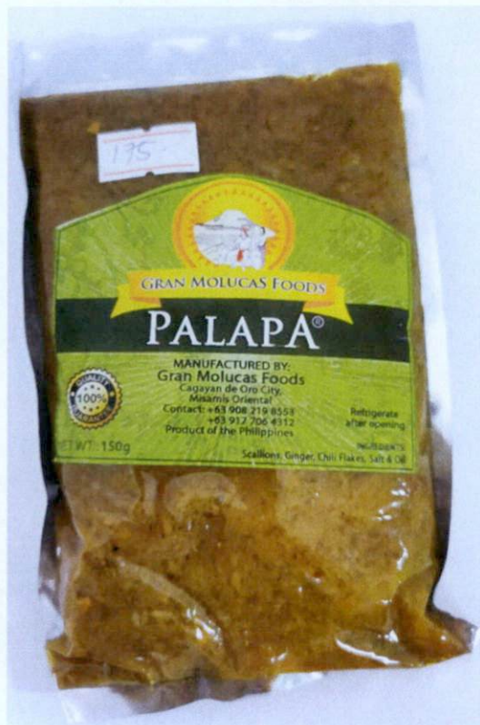
Figure 1. Unregistered GRAN MOLUCAS FOODS Palapa Scallion, Ginger, Chili Flakes, Salt & Oil

The Food and Drug Administration (FDA) warns all healthcare professionals and the general public NOT TO PURCHASE AND CONSUME the following unregistered food products: