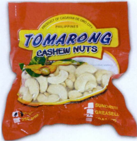
Figure 2. Unregistered TAMARONG Cashew Nuts