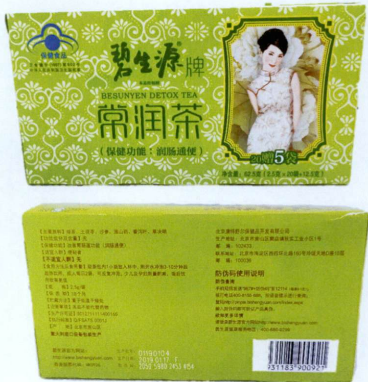
Figure 5. Unregistered BESUNYEN DETOX Tea in GreenBox