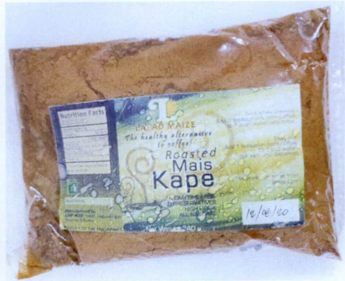
Figure 3. Unregistered LAPAD MAIZE Roasted Mais Kape