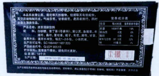
Figure 3. Unregistered SHENGHUA QINGHOULE