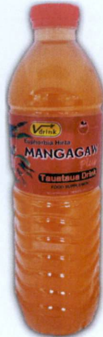
Figure 1. Unregistered VDRINK Euphorbia Hirta Mangagaw Plus Tauataua Drink Apple Flavor Food Supplement

The Food and Drug Administration (FDA) warns all healthcare professionals and the general public NOT TO PURCHASE AND CONSUME the following unregistered food supplements and food product: