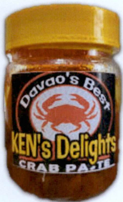
Figure 4. Unregistered KEN'S Davao's Best Delight Crab Paste