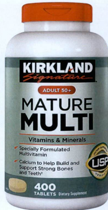
Figure 5. Unregistered KIRKLAND SIGNATURE Adult 50+ Mature Multi-Vitamins and Minerals Dietary Supplement