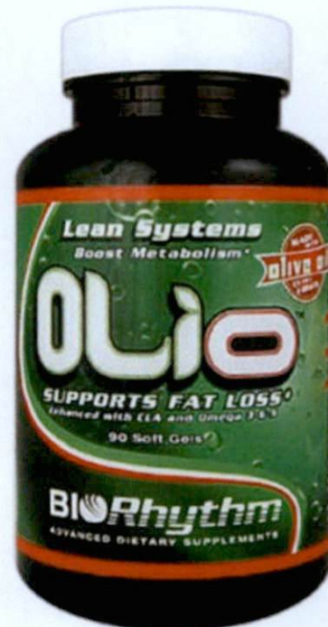
Figure 5. Unregistered BIORHYTHM Olio Supports Fat Loss Dietary Supplement