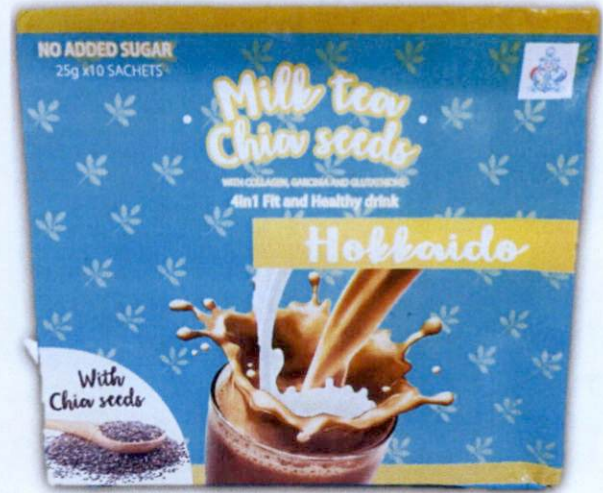
Figure 3. Unregistered Milk Tea Chia Seeds with Collagen, Garcinia and Glutathione 4in1 Fit and Healthy Drink Hokkaido