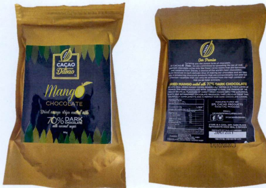
Figure 1. Unregistered CACAO DE DAVAO Mango Chocolate Dried Mango Strips Coated with 70% Dark Chocolate with Coconut Sugar

The Food and Drug Administration (FDA) warns all healthcare professionals and the general public NOT TO PURCHASE AND CONSUME the following unregistered food products and food supplements: