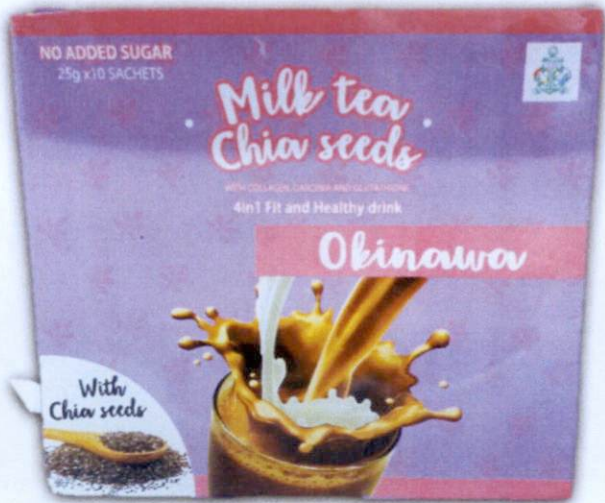
Figure 2. Unregistered Milk Tea Chia Seeds with Collagen, Garcinia and Glutathione 4in1 Fit and Healthy Drink Okinawa