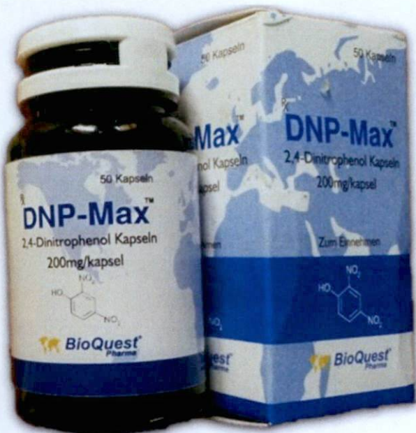
Figure 4. Unregistered BIOQUEST DNP-Max 2,4-Dinitrophenol L Kapseln