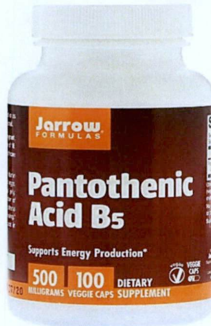
Figure 1. Unregistered JARROW FORMULAS® Pantothenic Acid B5 500mg Dietary Supplement, 100 Veggie Caps

The Food and Drug Administration (FDA) warns all healthcare professionals and the general public NOT TO PURCHASE AND CONSUME the following unregistered food supplements: