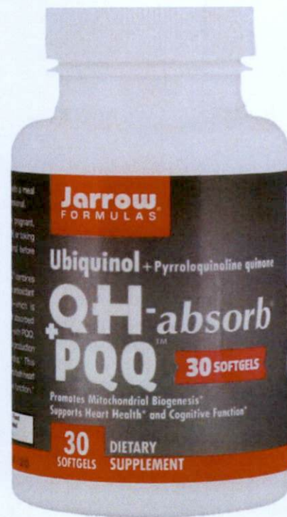
Figure 3. Unregistered JARROW FORMULAS® Ubiquinol QH-Absorb + PQQ Dietary Supplement, 30 Softgels