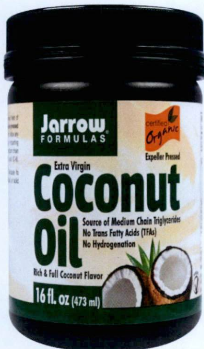
Figure 4. Unregistered JARROW FORMULAS® Extra Virgin Coconut Oil, 473ml (16fl. Oz)