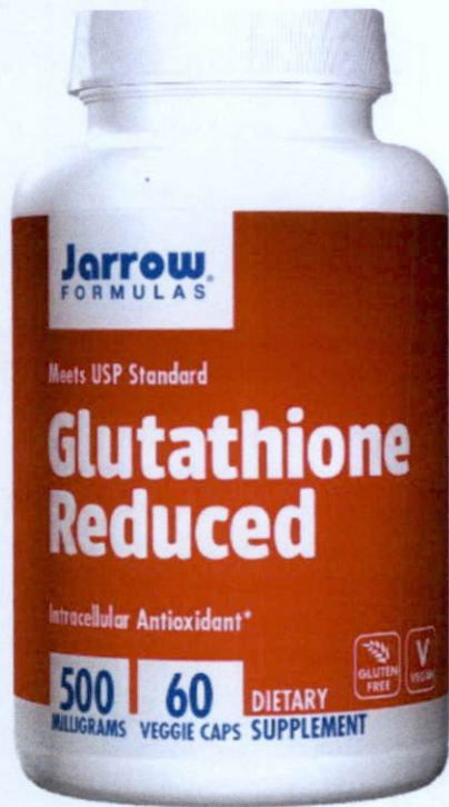
Figure 2. Unregistered JARROW FORMULAS® Glutathione Reduced 500mg Dietary Supplement, 60 Veggie Caps