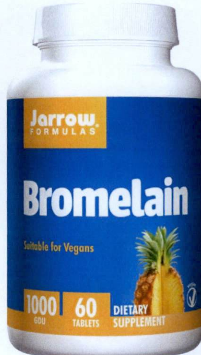
Figure 5. Unregistered JARROW FORMULAS® Bromelain 1000GDU Dietary Supplement, 60 Tablets