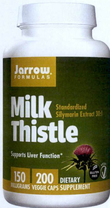
Figure 4. Unregistered JARROW FORMULAS® Milk Thistle Standardized Silymarin Extract 30:1 150mg, Dietary Supplement, 200 Veggie Caps