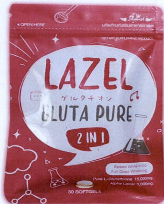
Figure 1. Unregistered LAZEL Gluta Pure 2 in 1 Softgels

The Food and Drug Administration (FDA) warns all healthcare professionals and the general public NOT TO PURCHASE AND CONSUME the following unregistered food supplements: