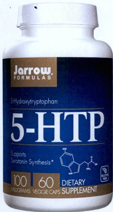
Figure 2. Unregistered JARROW FORMULAS® 5-HTP 100mg Dietary Supplement, 60 Veggie Caps