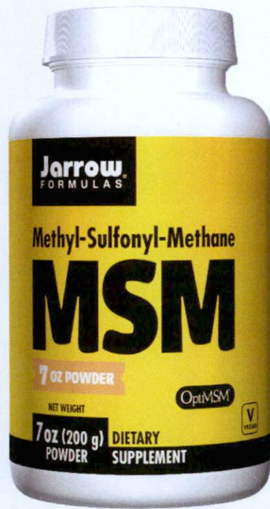
Figure 3. Unregistered JARROW FORMULAS® Methyl-Sulfonyl-Methane MSM Dietary Supplement, 200g (7oz) Powder