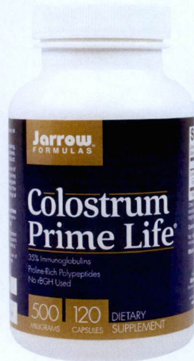
Figure 5. Unregistered JARROW FORMULAS® Colostrum Prime Life 500mg Dietary Supplement, 120 Capsules