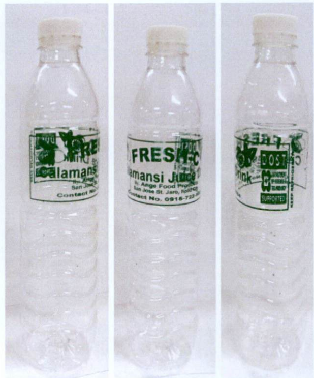
Figure 5. Unregistered FRESH-C Calamansi Juice Drink