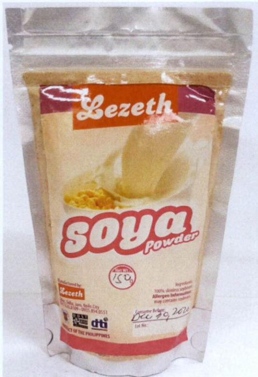
Figure 4. Unregistered LEZETH Soya Powder, 150g