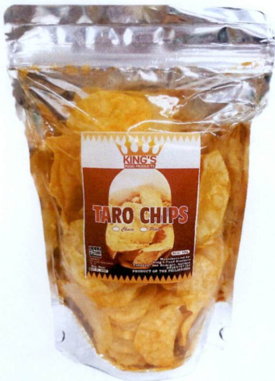
Figure 2. Unregistered KING'S FOOD PRODUCTS Taro Chips, Cheese, 100g