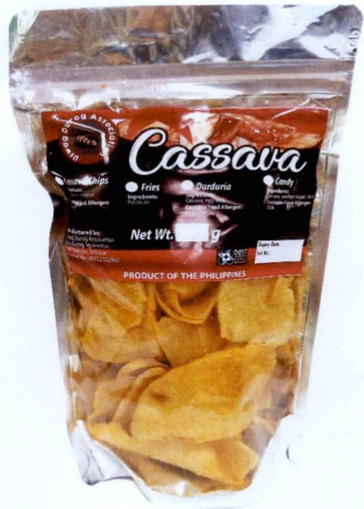
Figure 3. Unregistered USWAG DUROG ASSOCIATION Cassava Chips