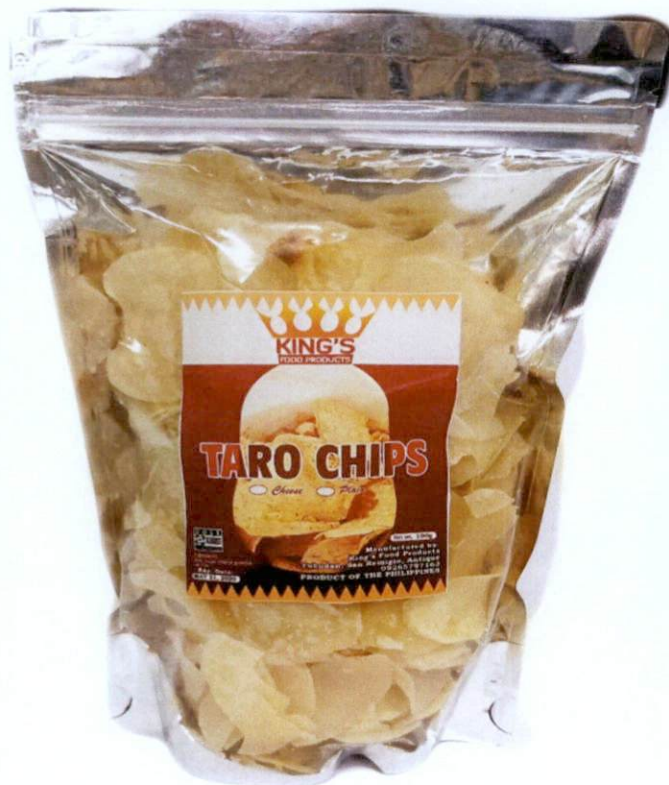
Figure 1. Unregistered KING'S FOOD PRODUCTS Taro Chips, Plain,100g

The Food and Drug Administration (FDA) warns all healthcare professionals and the general public NOT TO PURCHASE AND CONSUME the following unregistered food products: