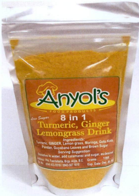
Figure 2. Unregistered ANYOL'S FOOD PRODUCTS Less Sugar 8 in 1 Turmeric, Ginger Lemongrass Drink, 180grams