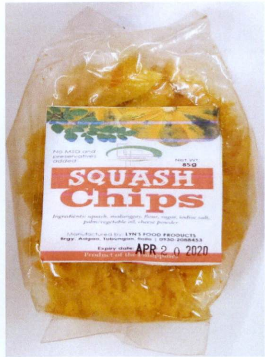
Figure 3. Unregistered SQUASH CHIPS, 85g