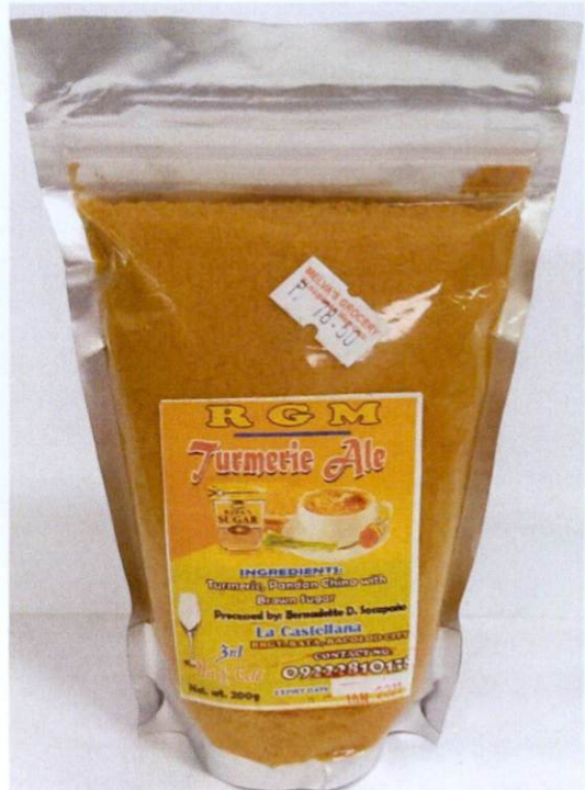
Figure 5. Unregistered RGM Turmeric Ale 3in1 Hot & Cold ,200g