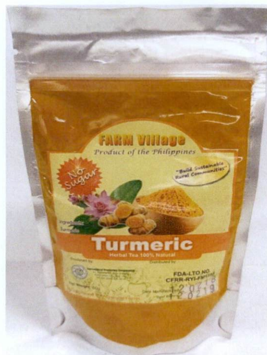
Figure 1. Unregistered FARM VILLAGE Turmeric Herbal Tea 100% Natural, 50g

The Food and Drug Administration (FDA) warns all healthcare professionals and the general public NOT TO PURCHASE AND CONSUME the following unregistered food products and Food Supplement: