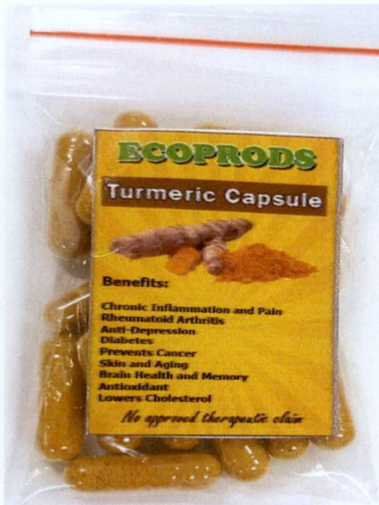
Figure 4. Unregistered ECOPRODS Turmeric Capsule