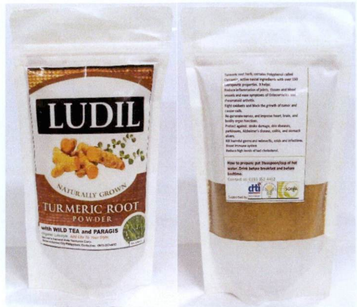
Figure 5. Unregistered LUDIL Naturally Grown Turmeric Root Powder with Wild Tea and Paragis