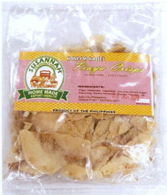
Figure 2. Unregistered SUSANNAH Deliciously Native Honey Molasses Piaya Crisps