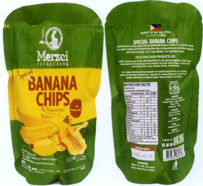
Figure 3. Unregistered MERZCI PASALUBONG Special Banana Chips with Sesame Seeds, 100g