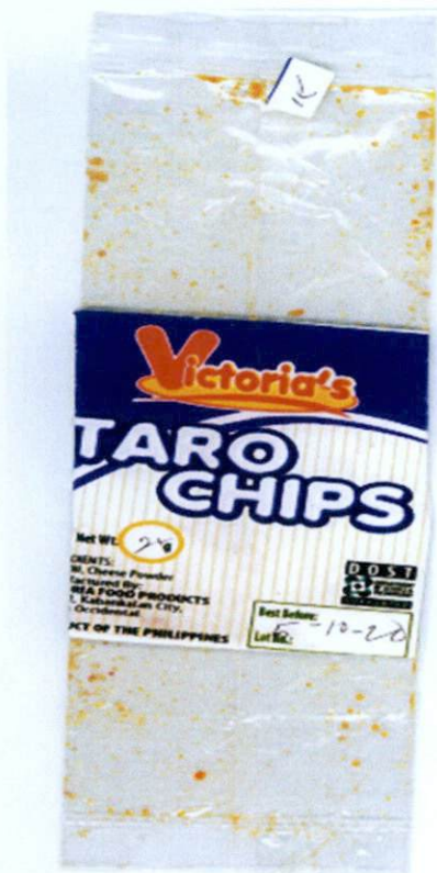
Figure 4. Unregistered VICTORIA'S Taro Chips, 25g