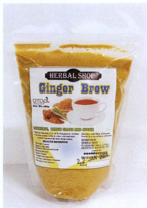
Figure 1. Unregistered HERBAL SHOP Ginger Brew, Turmeric, Lemon Grass and Sugar,180g

The Food and Drug Administration (FDA) warns all healthcare professionals and the general public NOT TO PURCHASE AND CONSUME the following unregistered food products: