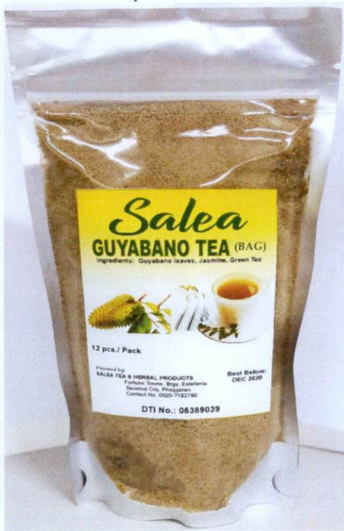
Figure 2. Unregistered SALEA Guyabano Tea (Bag), 12 pcs/Pack