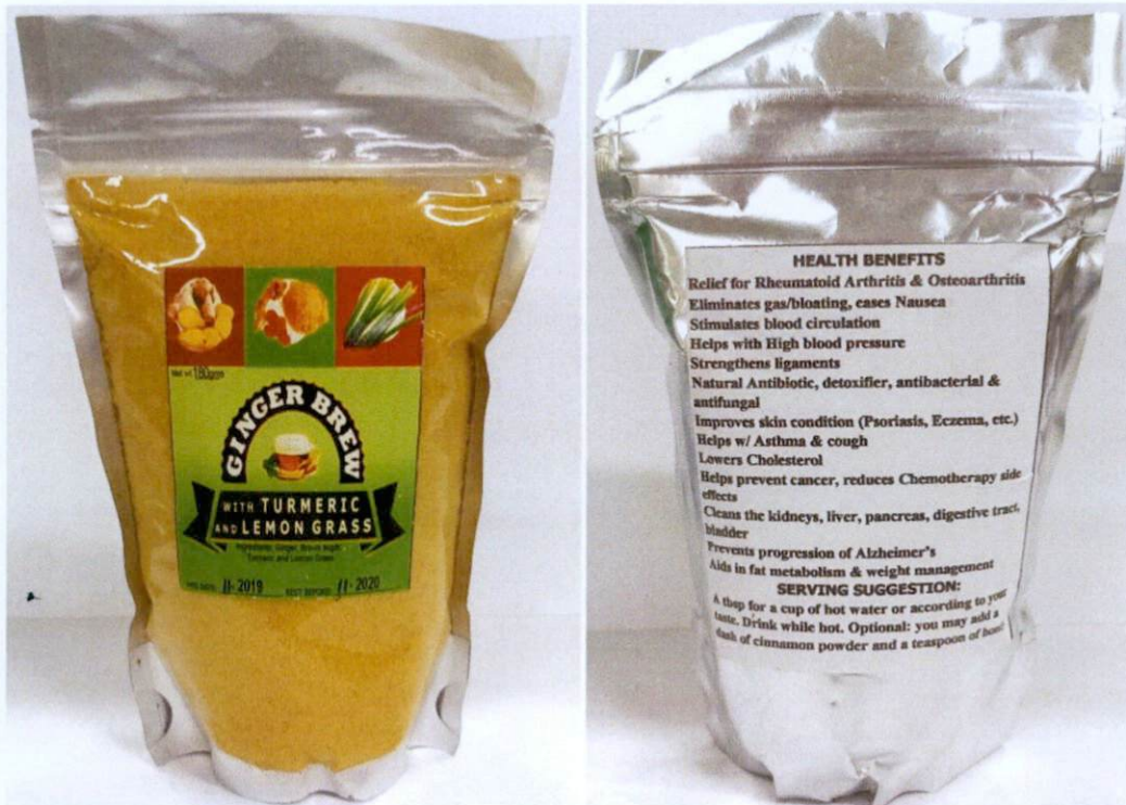
Figure 1. Unregistered GINGER BREW with Turmeric and Lemon Grass, 180gms

The Food and Drug Administration (FDA) warns all healthcare professionals and the general public NOT TO PURCHASE AND CONSUME the following unregistered food products: