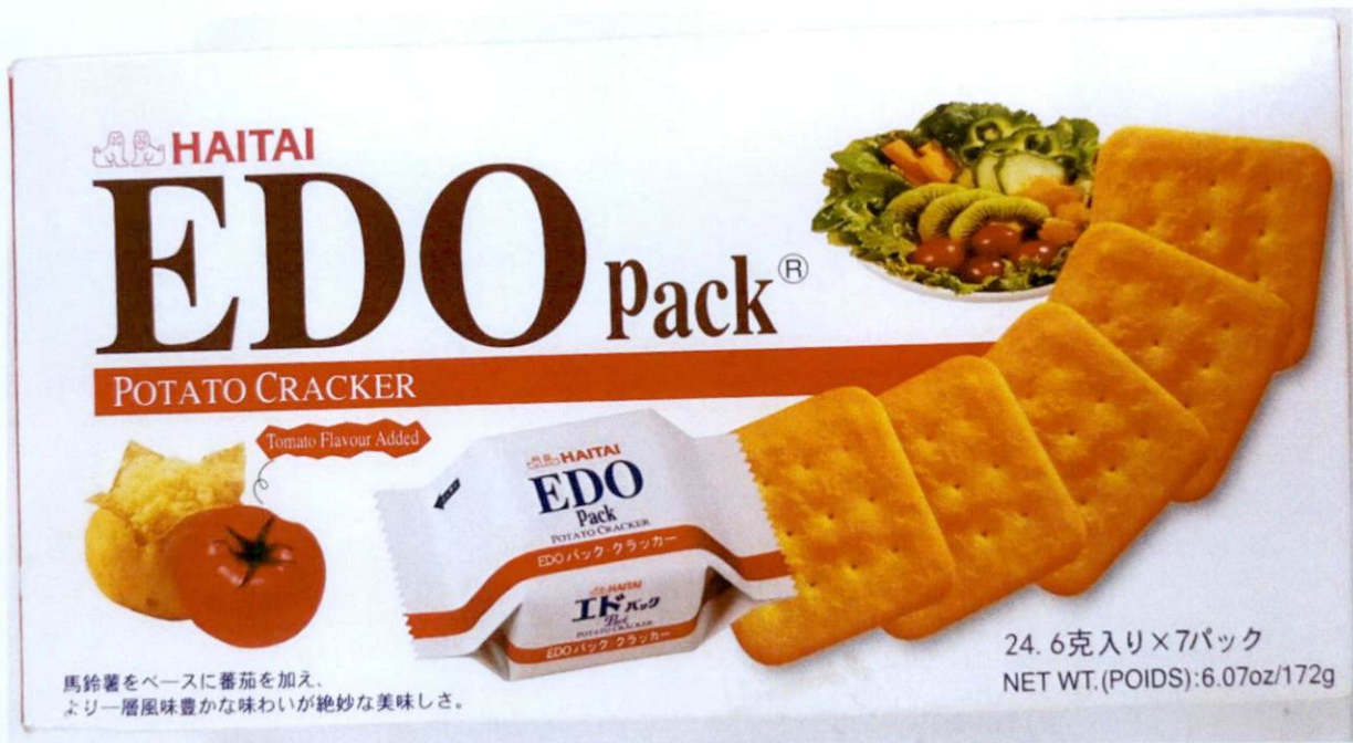
Figure 5. Unregistered HAITAI Edo Potato Cracker, 172g

The FDA verified through post-marketing surveillance that the abovementioned food products are not registered and no corresponding Certificates of Product Registration (CPR) have been issued. Pursuant to the Republic Act No. 9711, otherwise known as the “Food and Drug Administration Act of 2009”, the manufacture, importation, exportation, sale, offering for sale, distribution, transfer, non-consumer use, promotion, advertising or sponsorship of health products without the proper authorization is prohibited.