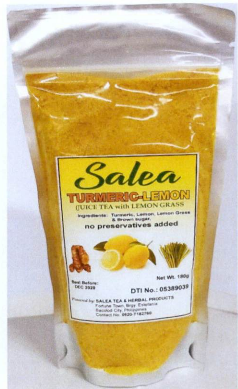
Figure 3. Unregistered SALEA Turmeric-Lemon Tea 180g