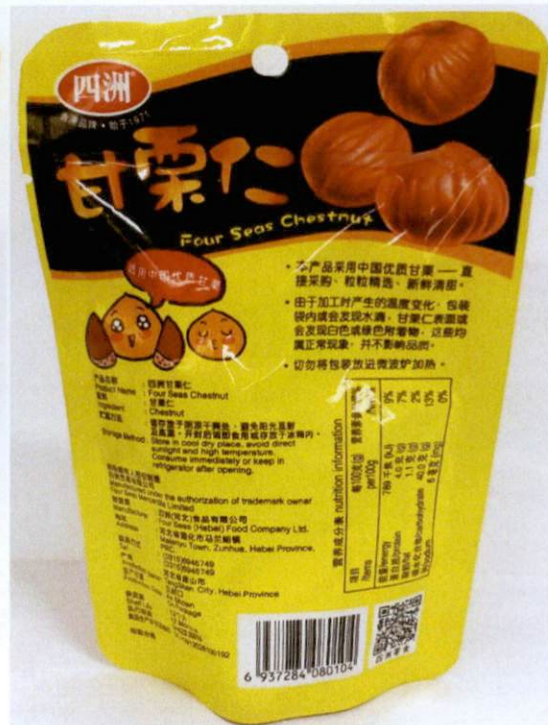
Figure 4. Unregistered Four Seas Chestnut, 50g (Brand Name in Foreign Character)