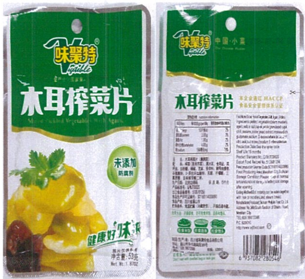
Figure 2. Unregistered VEGETABLE Sliced Pickled Vegetable with Agaric, 53g