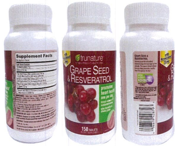
Figure 3. Unregistered TRUNATURE Grape Seed & Resveratrol, Dietary Supplement, 150 Tablets