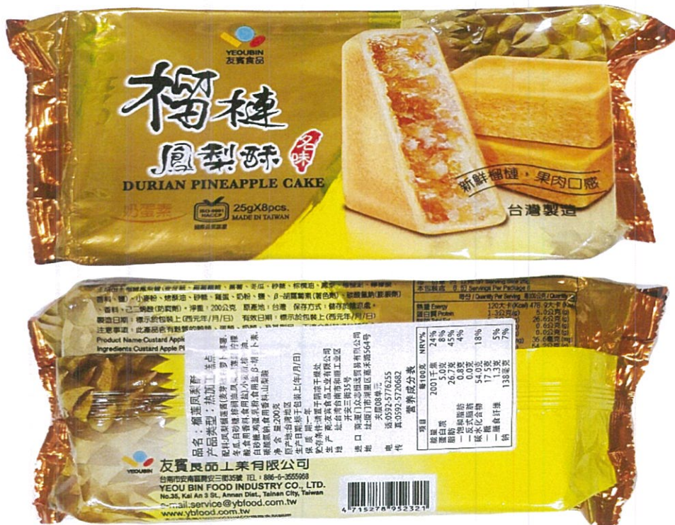
Figure 1. Unregistered YEUBIN Durian Pineapple Cake, 25g x 8pcs

The Food and Drug Administration (FDA) warns all healthcare professionals and the general public NOT TO PURCHASE AND CONSUME the following unregistered food products and food supplement: