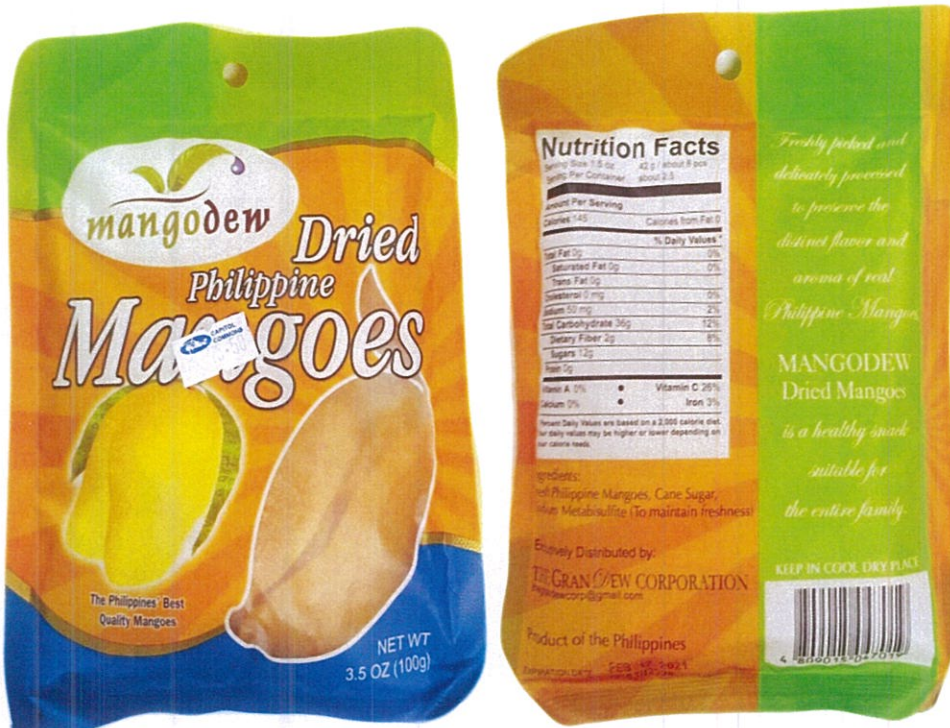
Figure 4. Unregistered MANGODEW Dried Philippine Mangoes, 100g