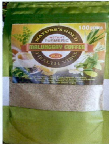
Figure 3. Unregistered NATURE'S GOLD Instant Turmeric Malunggay Coffee 20in1