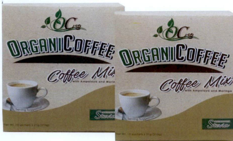
Figure 2. Unregistered OC Organic Coffee – Coffee Mix with Ampalaya and Malunggay