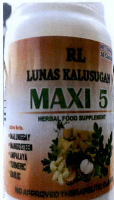
Figure 1. Unregistered RL LUNAS KALUSUGAN Maxi 5 Herbal Food Supplement, 30 Capsules

The Food and Drug Administration (FDA) warns all healthcare professionals and the general public NOT TO PURCHASE AND CONSUME the following unregistered food supplement and food products: