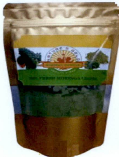
Figure 4. Unregistered NATURE'S GOLD Pure Organic Malunggay Powder