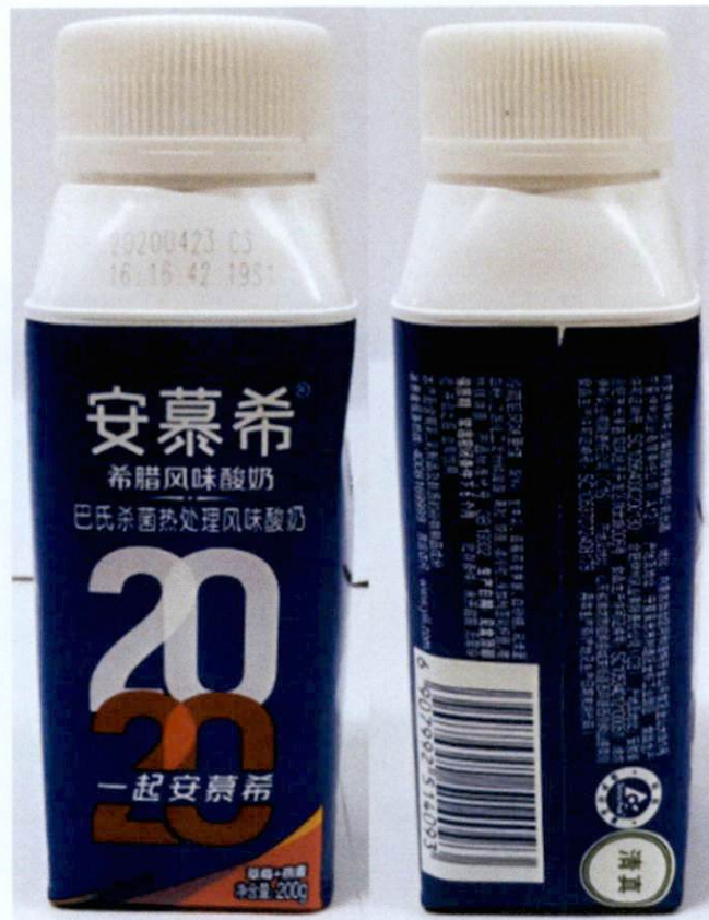
Figure 5. Unregistered Blue Carton Bottle with 2020 written in red and white, 200g (Labels are in foreign Characters)

The FDA verified through post-marketing surveillance that the abovementioned food products are not registered and no corresponding Certificates of Product Registration (CPR) have been issued. Pursuant to the Republic Act No. 9711, otherwise known as the “Food and Drug Administration Act of 2009”, the manufacture, importation, exportation, sale, offering for sale, distribution, transfer, non-consumer use, promotion, advertising or sponsorship of health products without the proper authorization is prohibited.