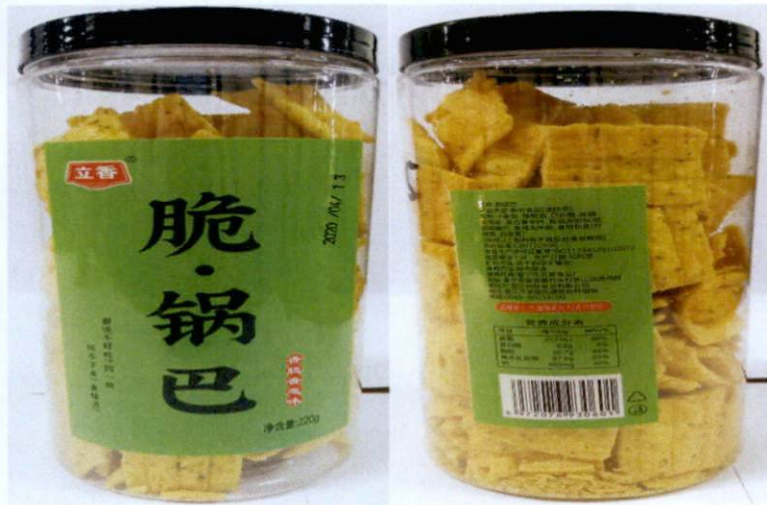
Figure 2. Unregistered Rigid Plastic Jar (chip like), 220g (Labels are in foreign Characters)