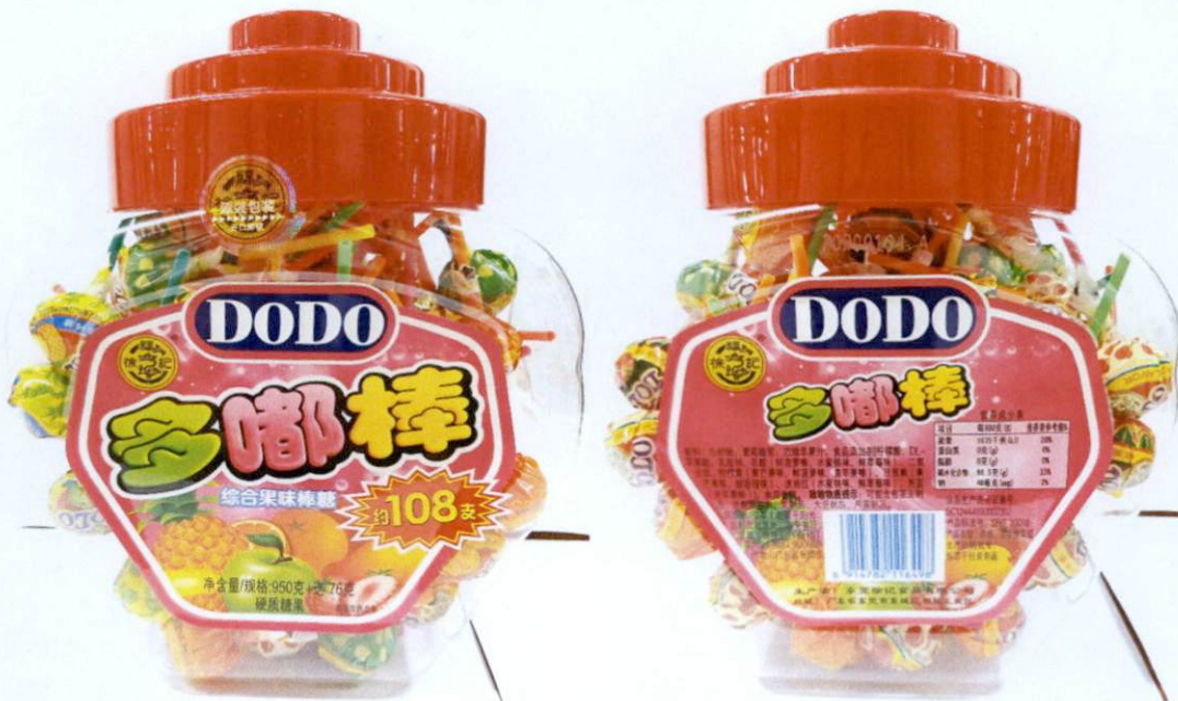
Figure 1. Unregistered DODO (lollipop in a rigid plastic red cap jar) (Labels are in foreign Characters)

The Food and Drug Administration (FDA) warns all healthcare professionals and the general public NOT TO PURCHASE AND CONSUME the following unregistered food products: