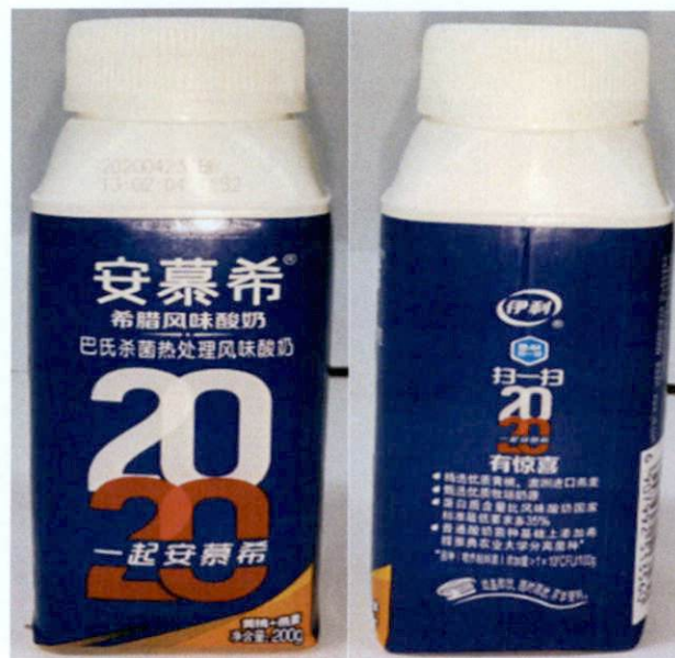
Figure 4. Unregistered Blue Carton Bottle with 2020 written in red and white), 200g (Labels are in foreign Characters)