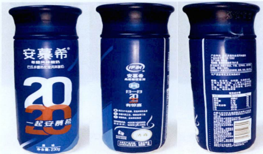
Figure 3. Unregistered Blue Packaging (bottle like) with 2020 written in red and white), 230g (Labels are in foreign Characters)