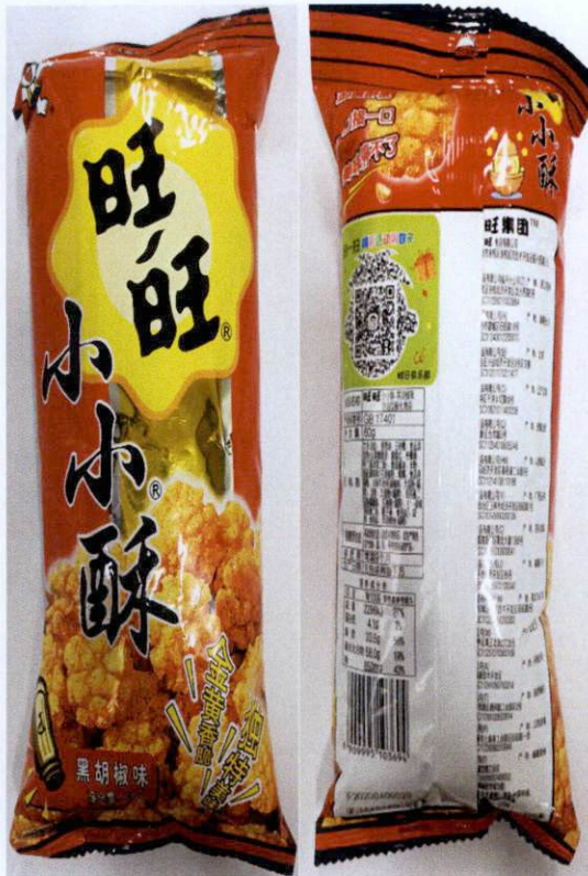
Figure 4. Unregistered Chips in Red Plastic Pouch, 60g (Labels are in foreign Characters)