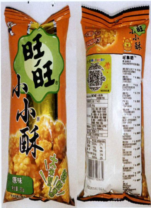
Figure 2. Unregistered Chips in Orange Plastic Pouch, 60g (Labels are in foreign Characters)