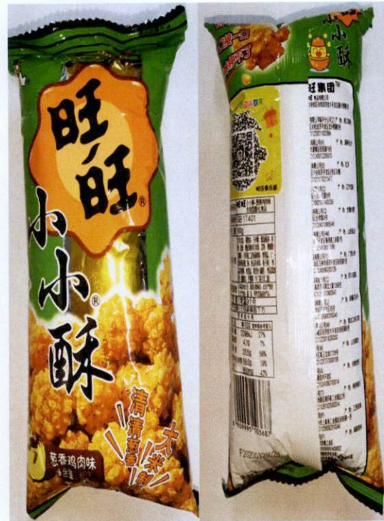
Figure 3. Unregistered Chips in Green Plastic Pouch, 60g (Labels are in foreign Characters)