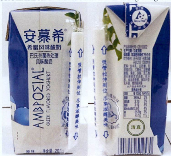
Figure 1. Unregistered AMBPOEIAL Greek Flavored Yoghurt (in blue tetra pack 205g with 2020 written in red and white) (Labels are in foreign Characters)

The Food and Drug Administration (FDA) warns all healthcare professionals and the general public NOT TO PURCHASE AND CONSUME the following unregistered food products: