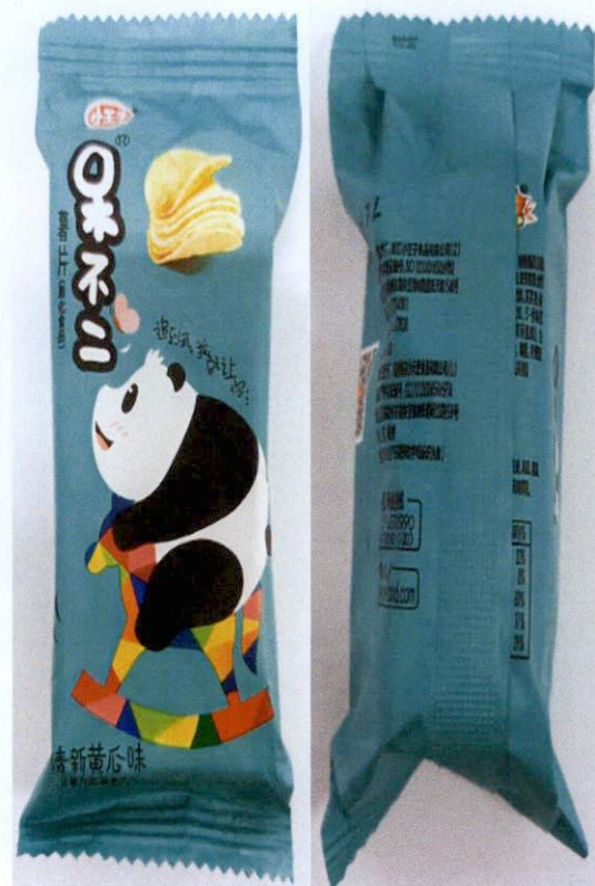
Figure 5. Unregistered Chips in Blue Green Plastic Sachet with Panda Drawing (Labels are in foreign Characters)