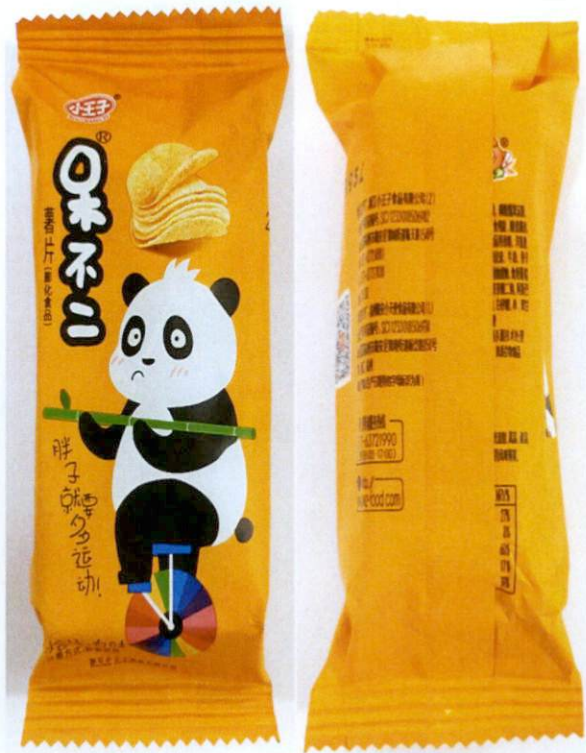
Figure 3. Unregistered Orange Plastic Sachet with Panda Drawing and Curl Chips (Labels are in foreign Characters)