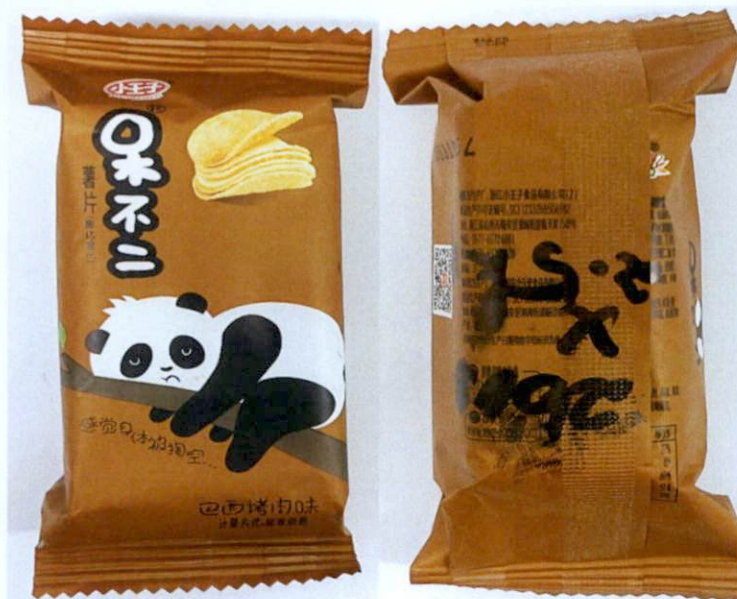
Figure 1. Unregistered Brown Plastic Sachet with Panda Drawing and Curl Chips (Labels are in foreign Characters)

The Food and Drug Administration (FDA) warns all healthcare professionals and the general public NOT TO PURCHASE AND CONSUME the following unregistered food products: