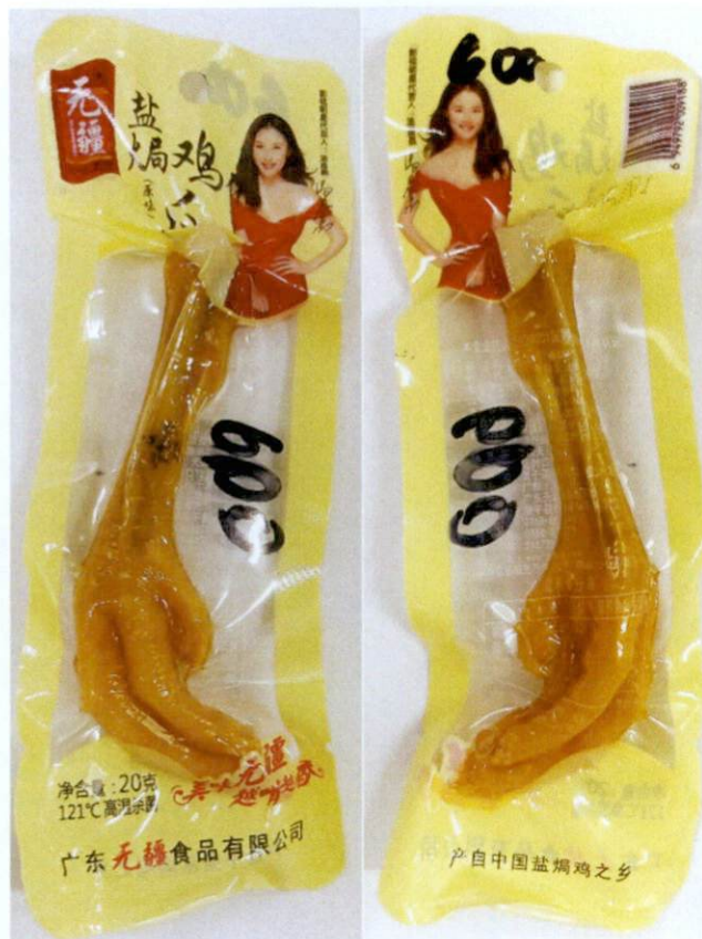
Figure 5. Unregistered Chicken Feet (in white and yellow transparent vacuumed packaging), 20 (Labels are in foreign Characters)

The FDA verified through post-marketing surveillance that the abovementioned food products are not registered and no corresponding Certificates of Product Registration (CPR) have been issued. Pursuant to the Republic Act No. 9711, otherwise known as the “Food and Drug Administration Act of 2009”, the manufacture, importation, exportation, sale, offering for sale, distribution, transfer, non-consumer use, promotion, advertising or sponsorship of health products without the proper authorization is prohibited.