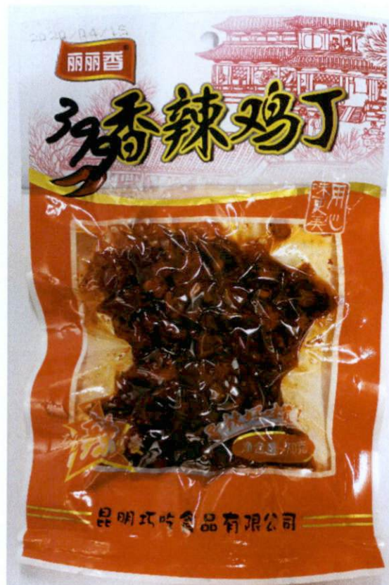
Figure 4. Unregistered White and Orange Vacuumed Sachet with Meat like Content (Labels are in foreign Characters)