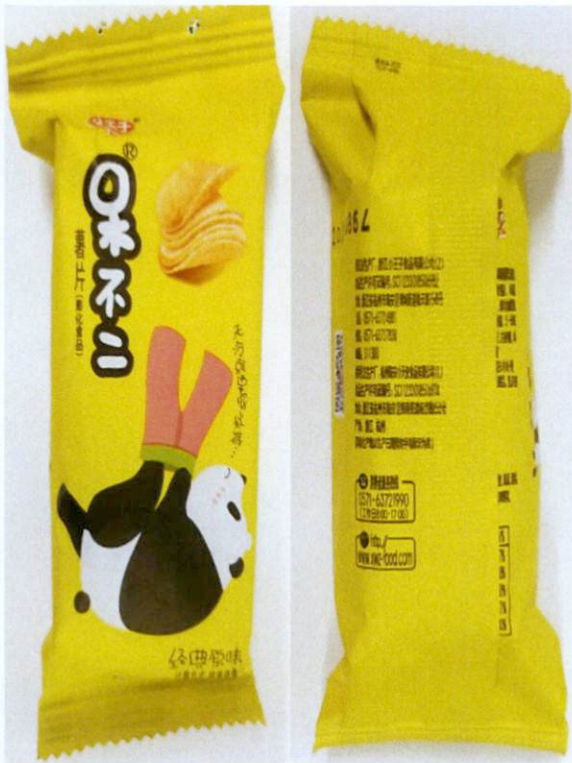
Figure 2. Unregistered Chips in Yellow Plastic Packaging with Panda Drawing (Labels are in foreign Characters)