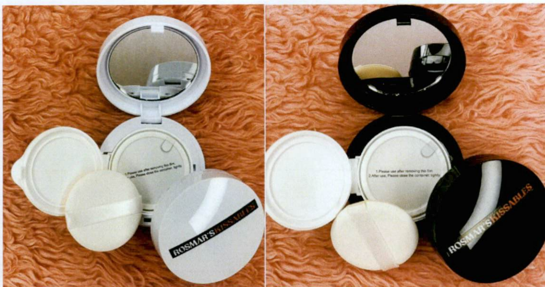
Figure 6. Unauthorized Product CC CUSHION BY ROSMAR'S KISSABLES

(Source: https://shopee.ph/CC-CUSHION-BY-ROSMAR'S-KISSABLES-i.6951058.5955128281 )