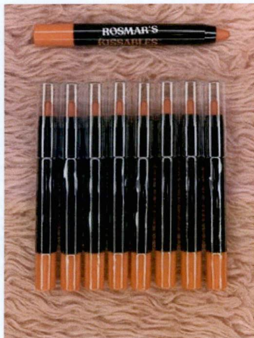
Figure 1. Unauthorized Product LIP CRAYON BY ROSMAR'S KISSABLES

The Food and Drug Administration (FDA) warns the public from purchasing and using the following unauthorized cosmetic products. (Refer to the image below)