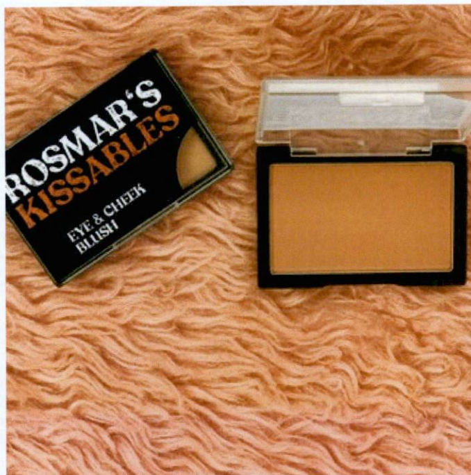
Figure 2. Unauthorized Product BLUSH-ON BY ROSMAR'S KISSABLES