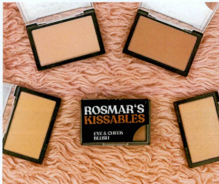
Figure 5. Unauthorized Product EYE AND CHEEK BLUSH BY ROSMAR'S KISSABLES

(Source: https://shopee.ph/BROW-LINER-BY-ROSMAR'S-KISSABLES-i.6951058.6355125582 )