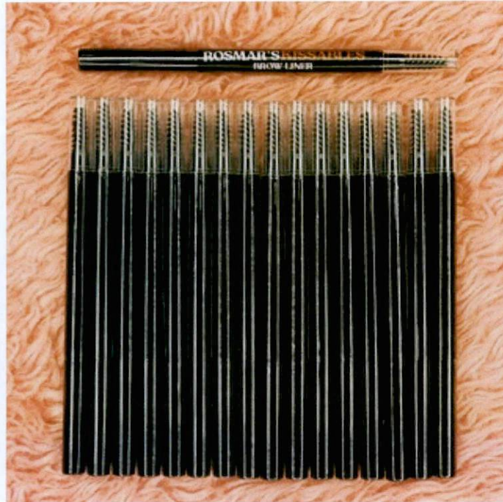
Figure 4. Unauthorized Product BROW LINER BY ROSMAR'S KISSABLES