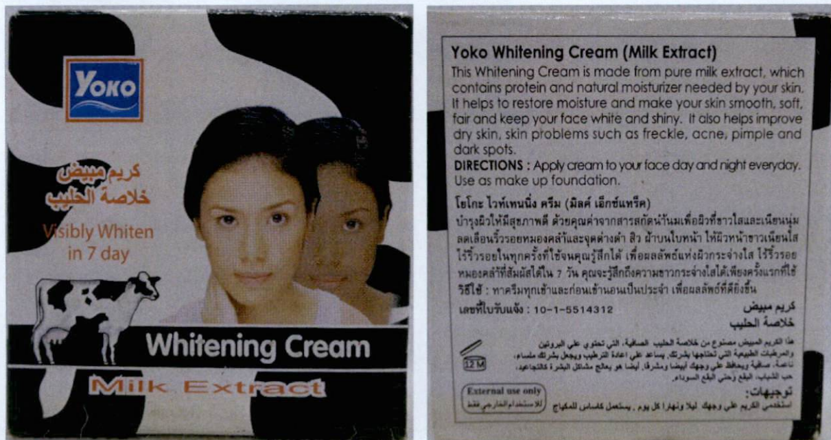
Figure 1. Counterfeit Yoko Whitening Cream (Milk Extract)

The Food and Drug Administration (FDA) warns the public from purchasing and using the below counterfeit cosmetic product: