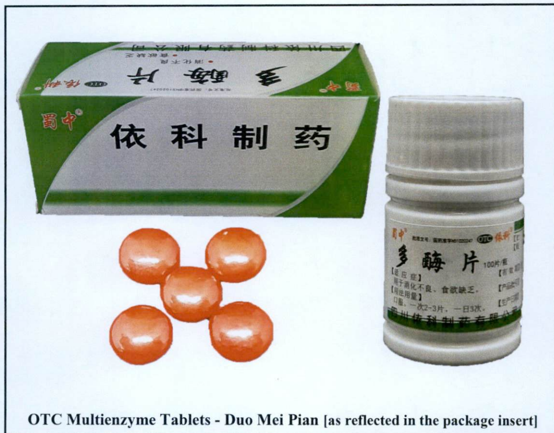
OTC Multienzyme Tablets - Duo Mei Pian [as reflected in the package insert]

The Food and Drug Administration (FDA) advises the public against the purchase and use of the following unregistered drug products: