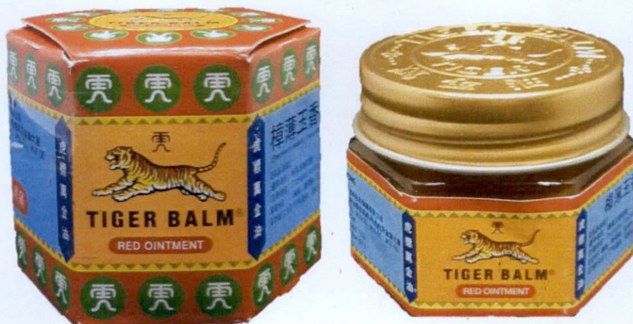
Tiger Balm® Red Ointment