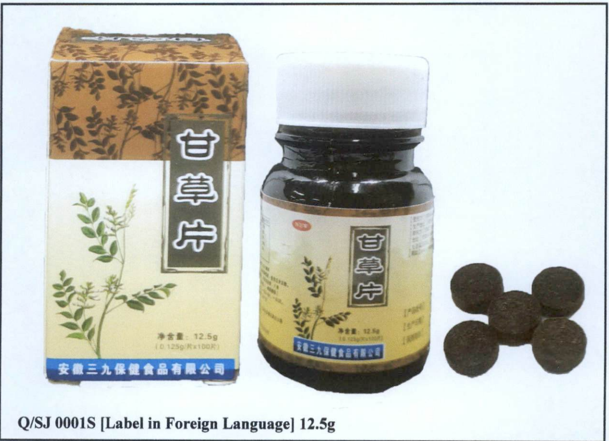
Figure 3. Unregistered drug product