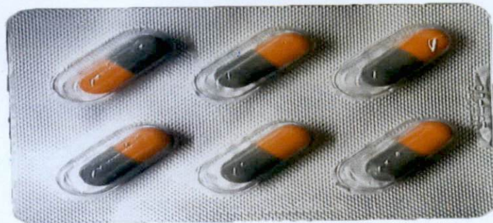
Luo Hong Mei Su Jiao Nang 150mg by: Jiangsu Fubang Pharmaceutical Co., Ltd