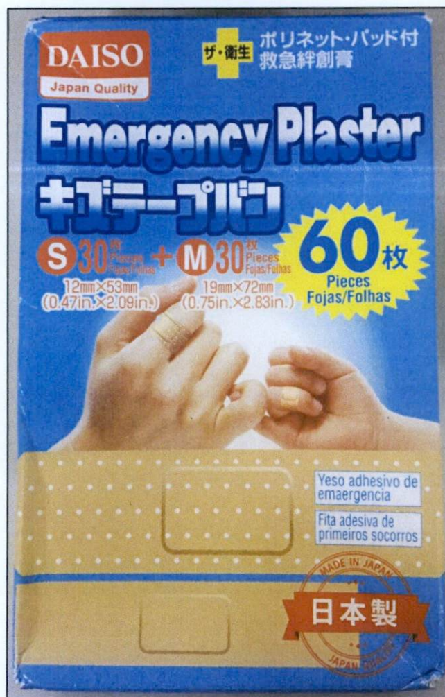
Figure 1. Unregistered/Unnotified Daiso Emergency Plaster

The Food and Drug Administration (FDA) warns all healthcare professionals and the general public NOT TO PURCHASE AND USE the unregistered/unnotified medical device product: