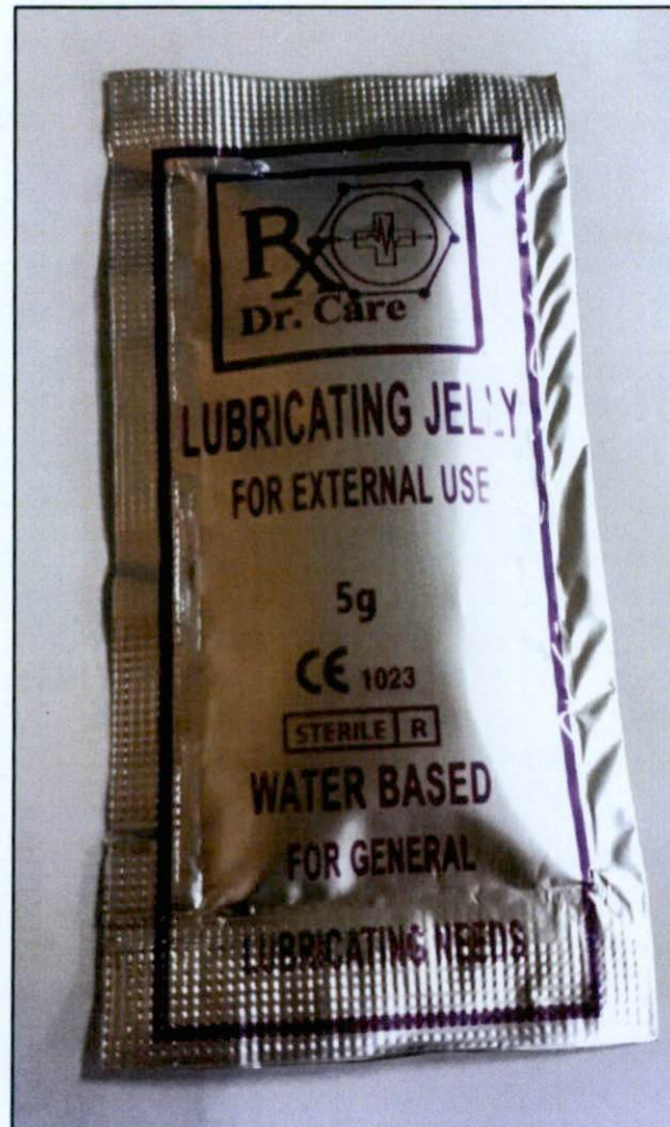
Figure 1. Unnotified Rx Dr. Care – Lubricating Jelly

The Food and Drug Administration (FDA) warns all healthcare professionals and the general public NOT TO PURCHASE AND USE the unnotified medical device product: