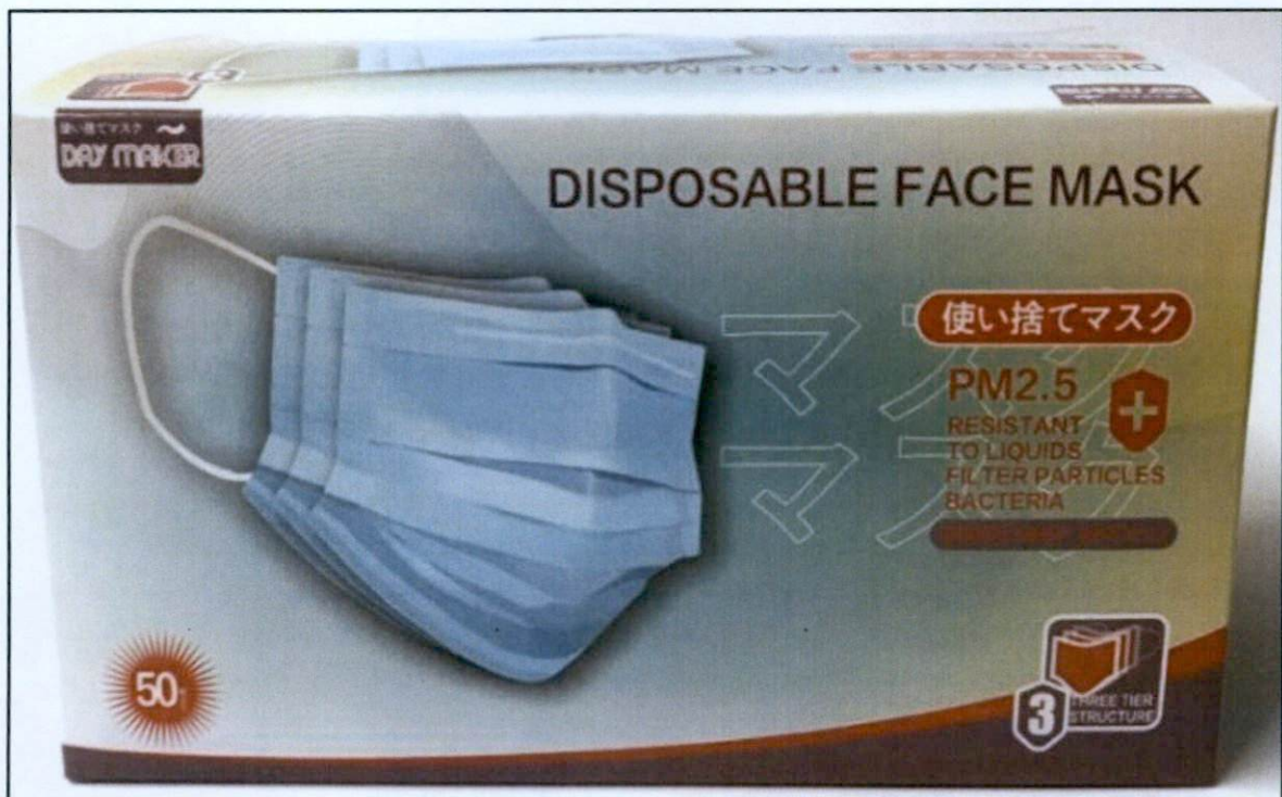
Figure 1. Unnotified Day Maker Disposable Face Mask

The Food and Drug Administration (FDA) warns all healthcare professionals and the general public NOT TO PURCHASE AND USE the unnotified medical device products: