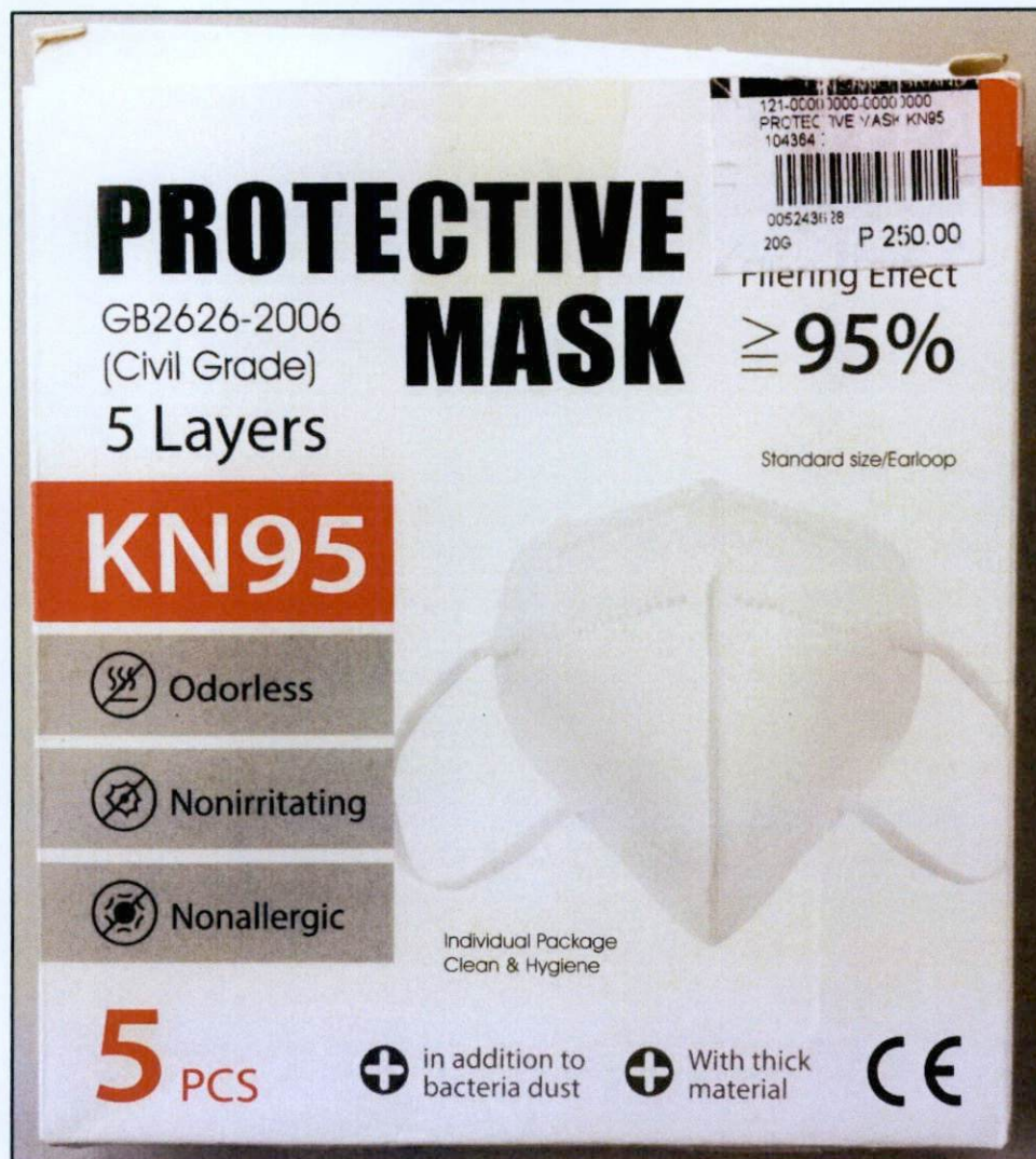
Figure 1. Unnotified FFP2 Protective Mask GB2626-2006 (Civil Grade) 5 Layers KN95

The Food and Drug Administration (FDA) warns all healthcare professionals and the general public NOT TO PURCHASE AND USE the unnotified medical device product: