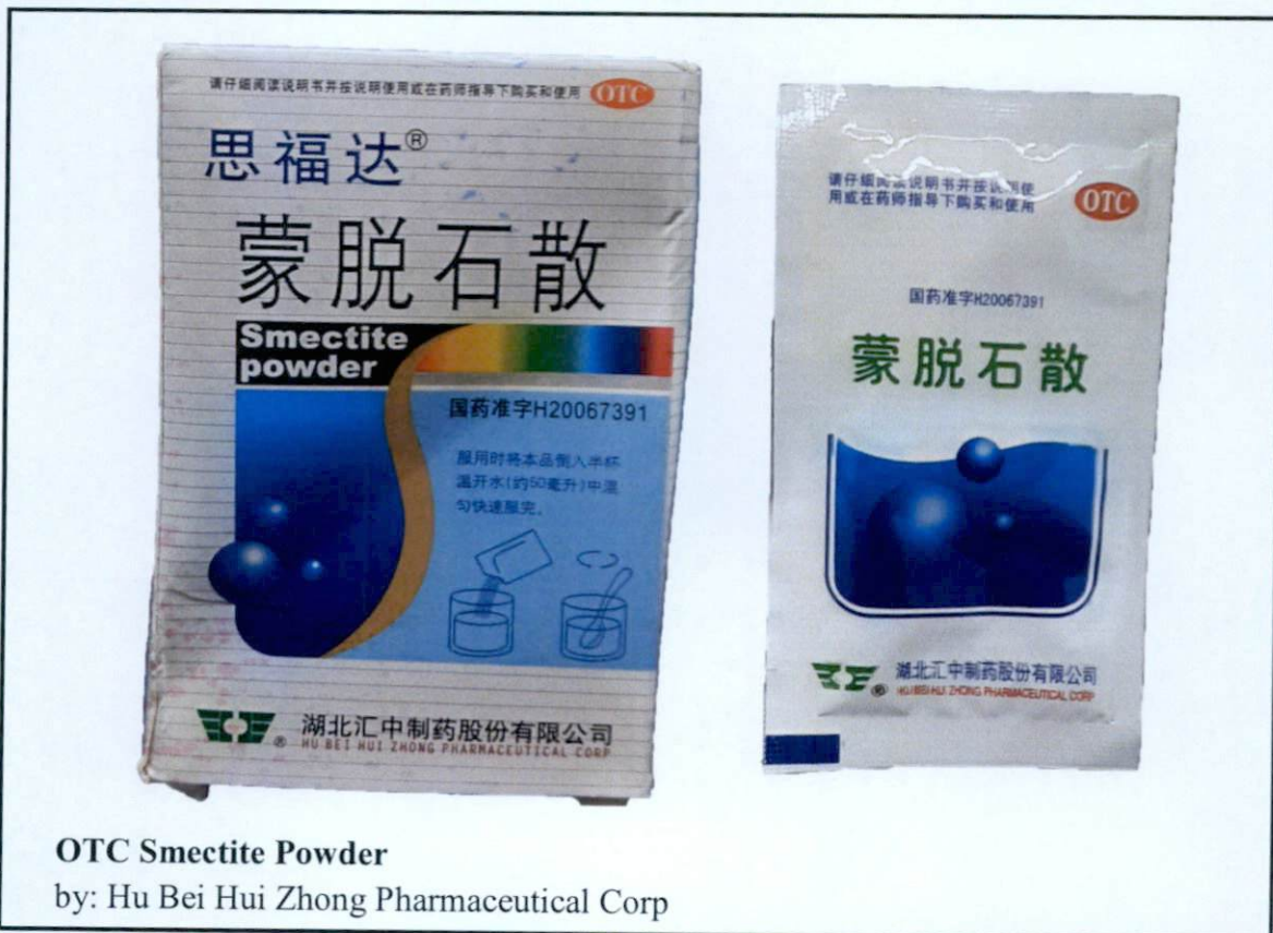
OTC Smectite Powder