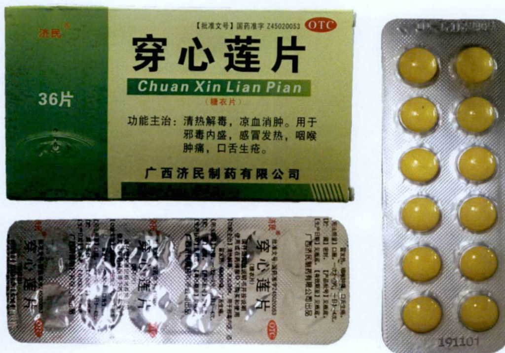
OTC Chuan Xin Lian Pian