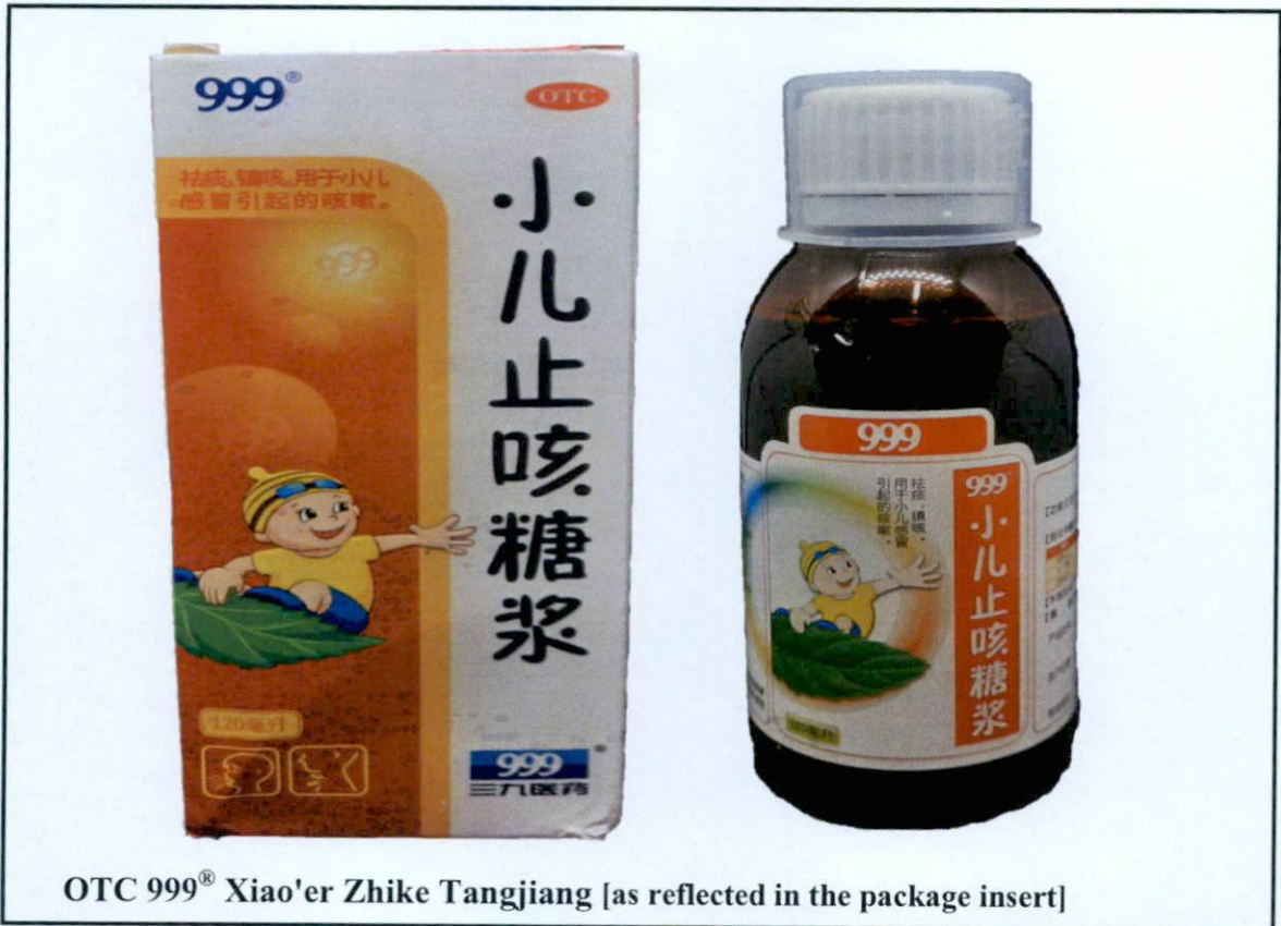
OTC 999 ® Xiao'er Zhike Tangjiang [as reflected in the package insert]