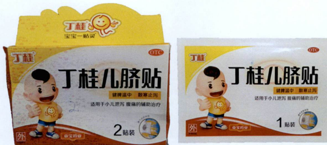
OTC Dinggui Erqi Tie [as reflected in the package insert] by: Yabao Pharmaceutical Group Co., Ltd.