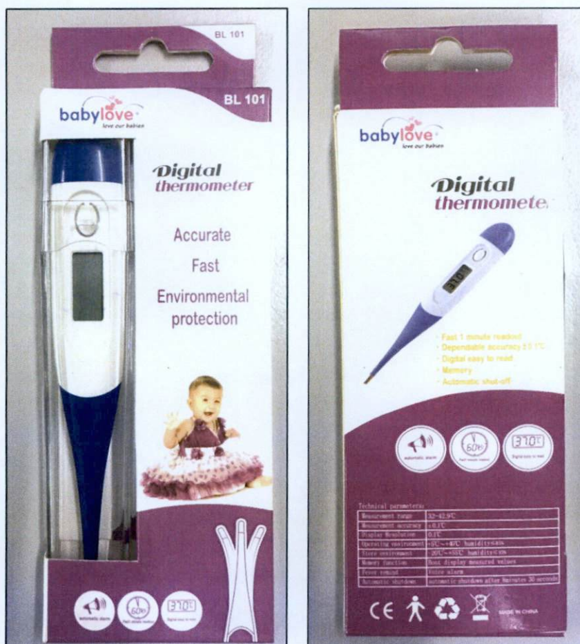
Figure 1. Unregistered Babylove Digital Thermometer

The Food and Drug Administration (FDA) warns all healthcare professionals and the general public NOT TO PURCHASE AND USE the following unregistered medical device products: