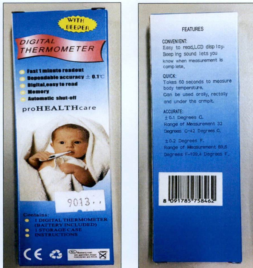
Figure 2. Unregistered proHEALTHcare Digital Thermometer