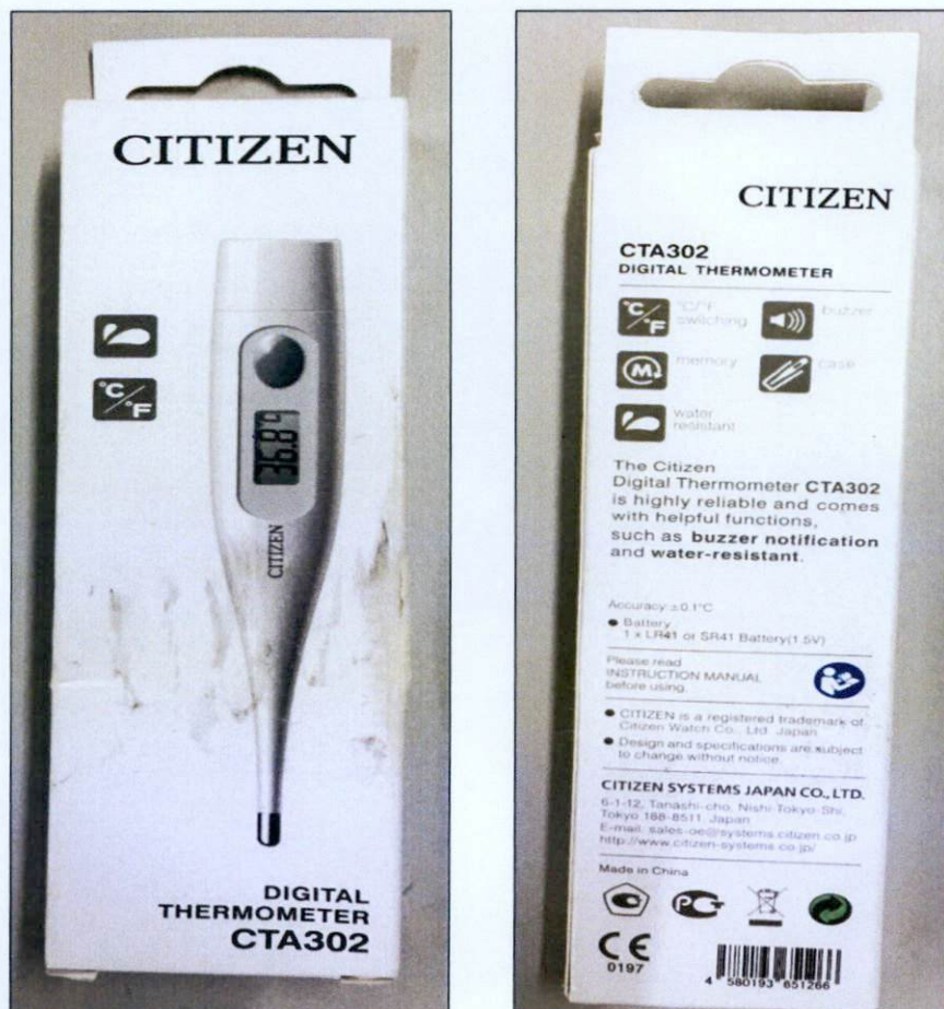
Figure 3. Unregistered Citizen Digital Thermometer CTA302